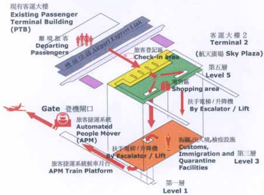
→ 離境旅客人流方向 (由客運大樓 2 乘坐旅客捷運系統列車前往現有客運大樓) DEPARTING PASSENGERS FLOW (from Terminal 2 via APM to existing PTB)