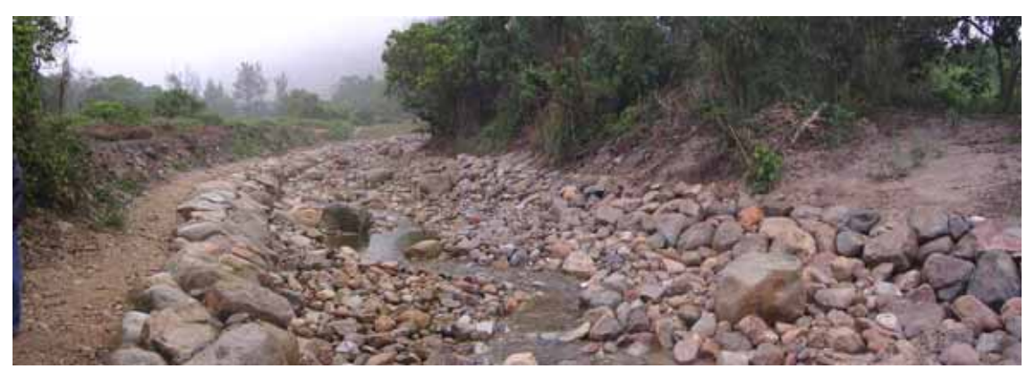
(b) After reinstatement (3 April 2004)