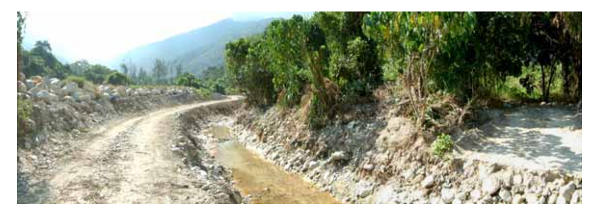
(a) After excavation (before reinstatement) (7 November 2003)