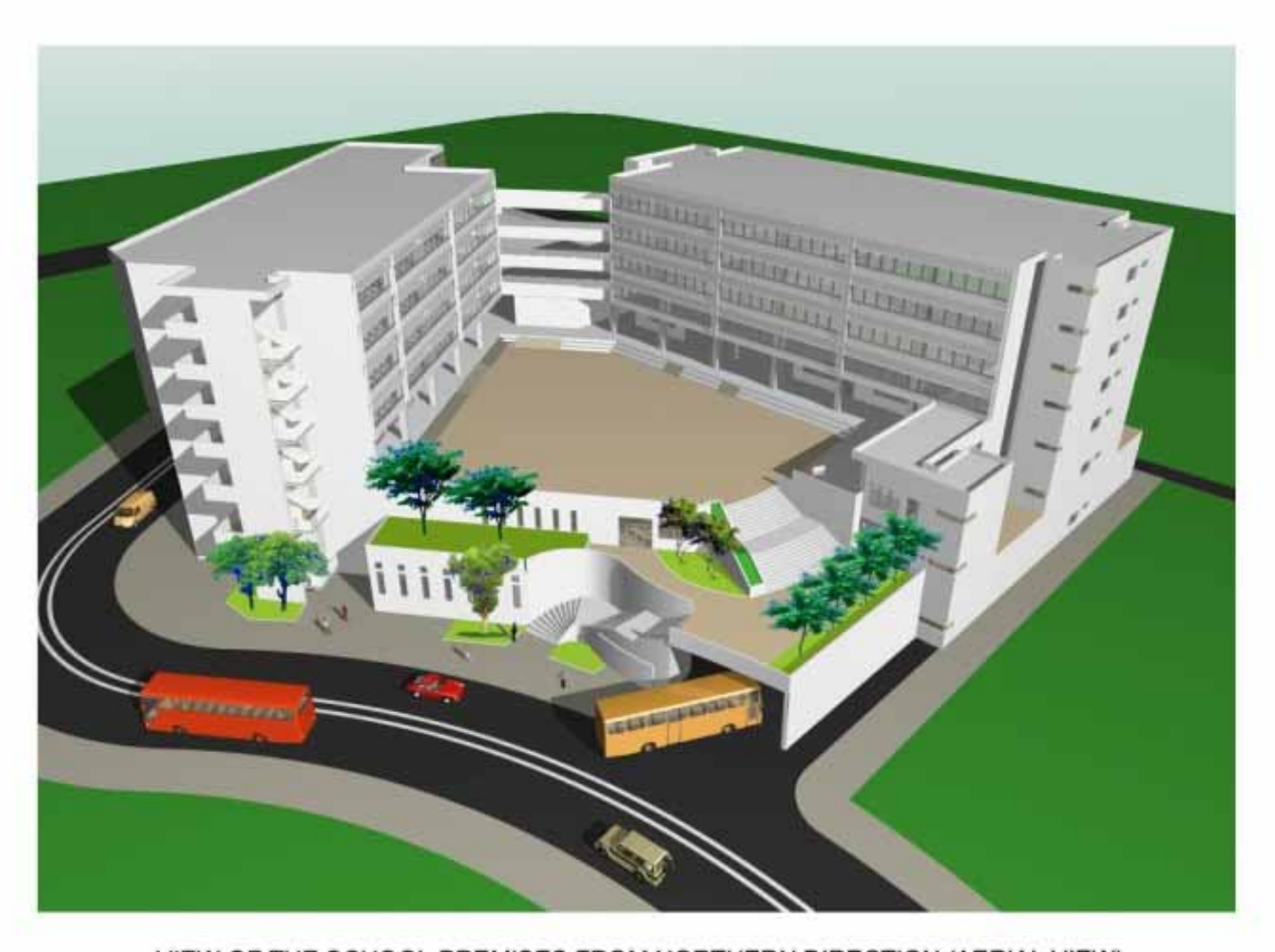
VIEW OF THE SCHOOL PREMISES FROM NORTHERN DIRECTION (AERIAL VIEW) 從北面望向校舍的鳥瞰效果圖