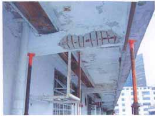
Location : Cantilever Beam at 4/F of Block 1 Defect : Cantilever beam propped