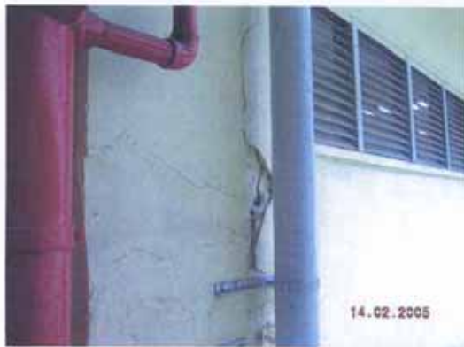
Location : 4/F Column in Link Block Defect : Cracks