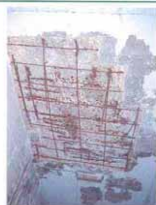
Location : Block 2 - Ceiling at corridor at 4/F Action : Spalling repair