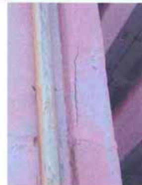
Location : Block 1/link block - 1/F column Defect : Cracked