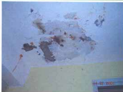
Location : 3/F Slab at Link Block Defect : Dampness at Ceiling