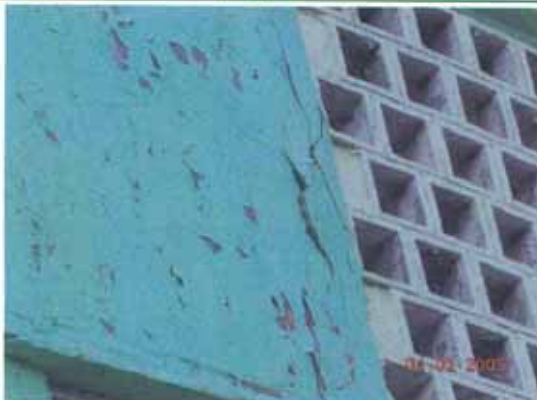
Location : Wall at 2/F Defect : Seriously spalled