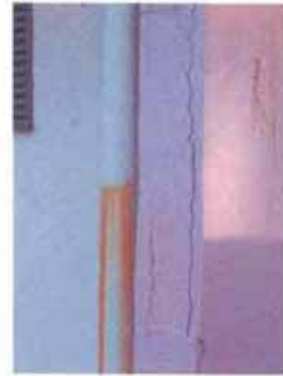
Location : Block 1/link block – 4/F column Defect : Cracked