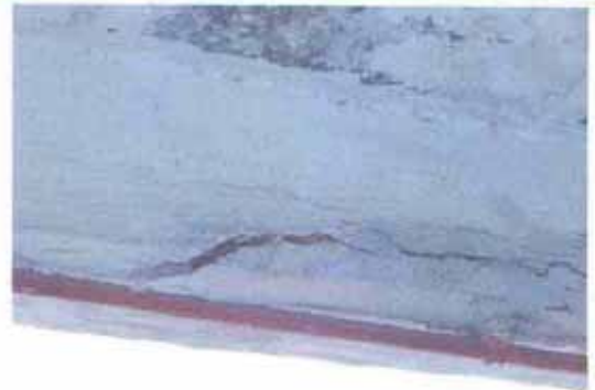
Location : Block 2 - 6/F edge beam Defect : Spalled concrete