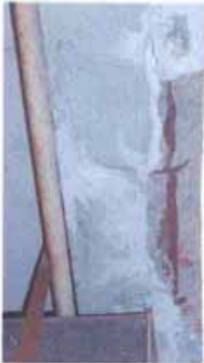
Location : Block 1 - 5/F edge beam Defect : Spalled concrete