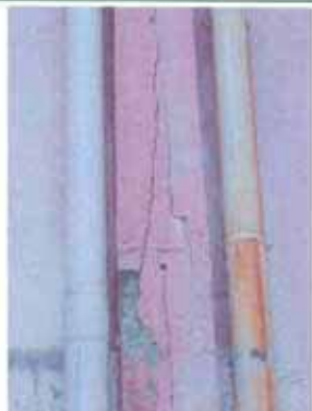
Location : Block 1/link block - 1/F column Defect : Seriously spalled