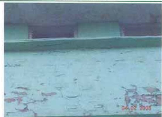
Location : Wall at 1/F Defect : Seriously spalled