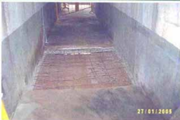
Location : Block 2 - Slab at corridor at 5/F Action: Recasting defective slab