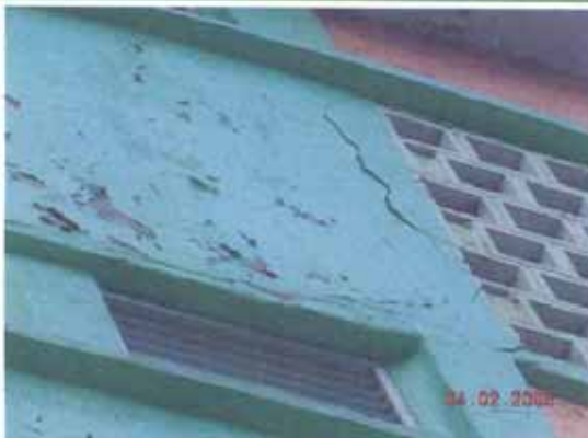
Location : Wall at 6/F Defect : Seriously spalled