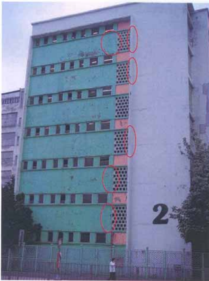
Location : Block 2 – External wall Defect : Structural elements in bad condition