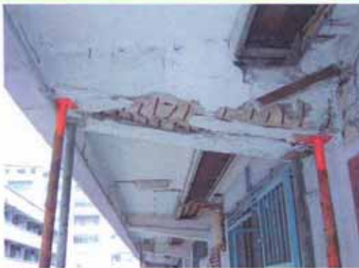
Location : Cantilever Beam at 2/F of Block 3 Defect : Seriously spalled