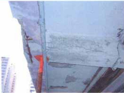
Location : Cantilever Beam at 2/F of Block 1 Defect : Seriously spalled