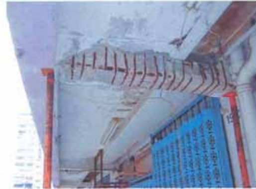
Location : Cantilever Beam at 2/F of Block 1 Defect : Seriously spalled