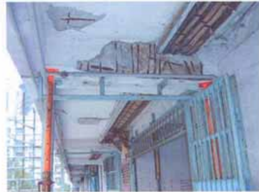
Location : Cantilever Beam at 2/F of Block 1 Defect : Seriously spalled