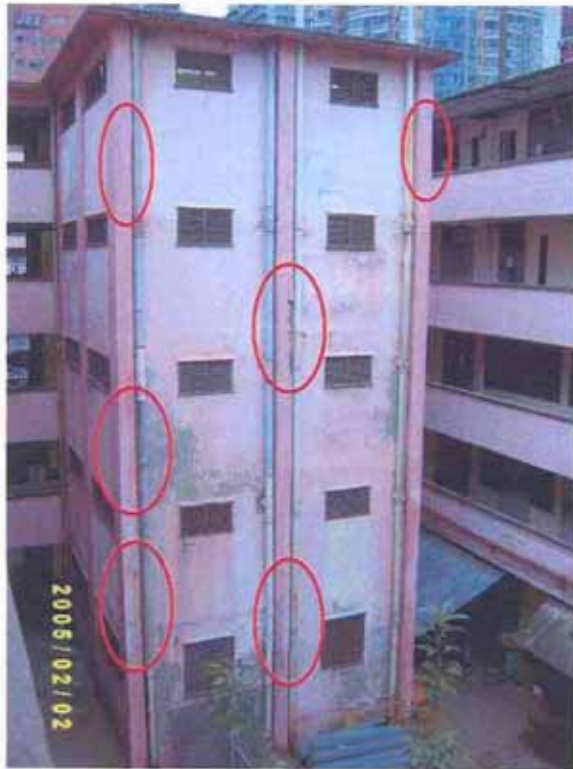
Location : Block 1/link block edge columns Defect : Seriously spalled