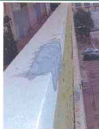
Location : Block 1 - parapet at 5/F Action : Hazard removed and repaired