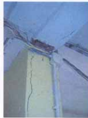
Location : 3/F Column & Beam in Link Block Defect : Vertical cracks