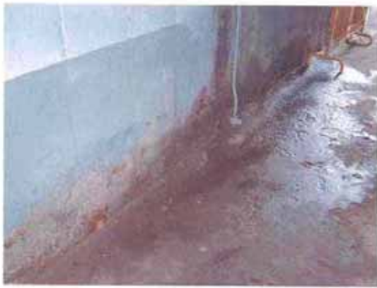
Location : Block 2 - corridor at 4/F Problem : Water seepage from toilet