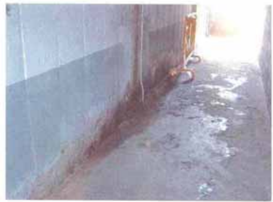
Location : Block 2 - corridor at 4/F Action : Water seepage rectified