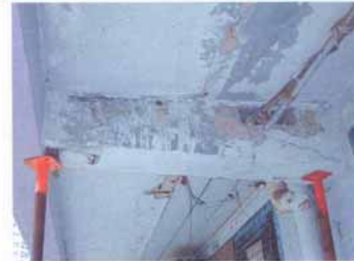
Location : Cantilever Beam at 4/F of Block 5 Defect : Seriously spalled