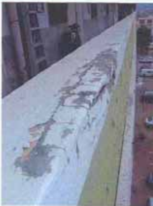
Location : Block 1 - parapet at 5/F Defect: Concrete spalled