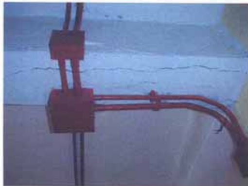
Location : 1/F Beam at Link Block Defect : Longitudinal cracks