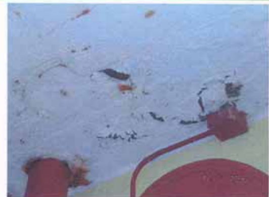
Location : 3/F Slab at Link Block Defect : Dampness at Ceiling