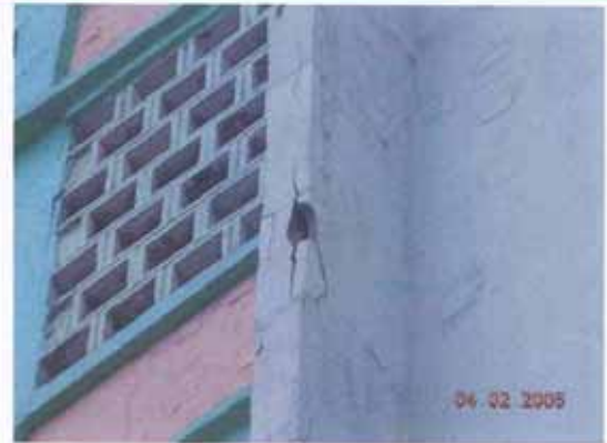
Location : Wall at 5/F Defect : Broken edge, seriously spalled