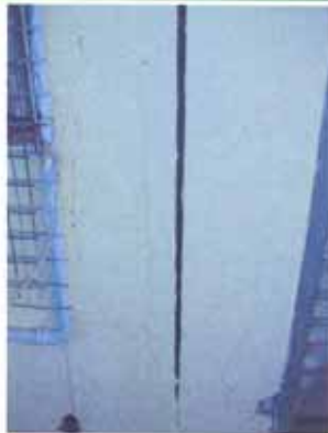
Location : 2/F Columns at Unit 208 & 209 Defect : Vertical cracks