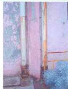
Location : Block 1/link block - G/F column Defect : Cracked