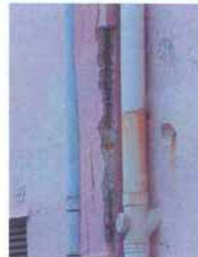
Location : Block 1/link block – 4/F column Defect : Seriously spalled