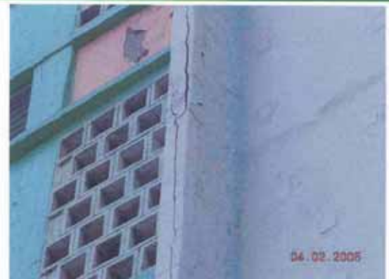
Location : Wall at 3/F Defect : Seriously spalled