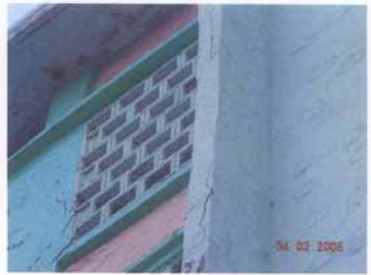
Location: Wall at 6/F Defect : Broken edge, seriously spalled