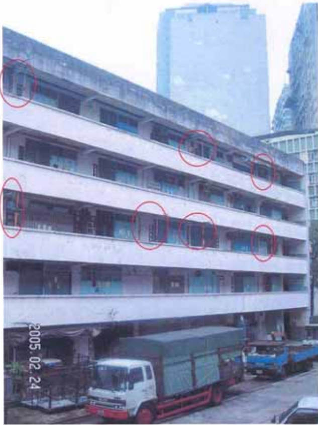
Location : Block 1 Balcony corridors Defect : Defective cantilever beams propped