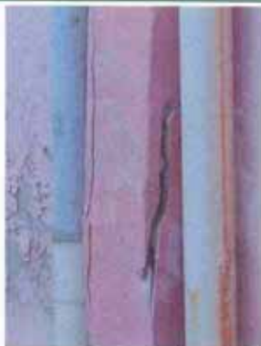
Location : Block 1/link block - 2/F column Defect : Seriously spalled