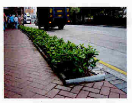
籬笆種植 Hedge Planting