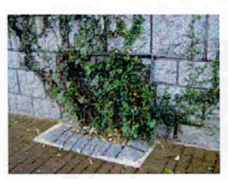
聽腳花槽種植攀綠植物 Climber Planting in Toe Planter