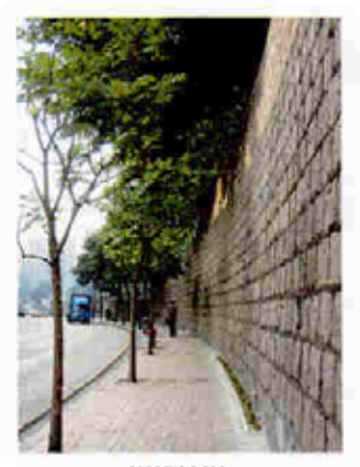
樹樹植樹 Tree Planting in Tree Pit