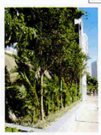
花槽種植 Planting in Planter