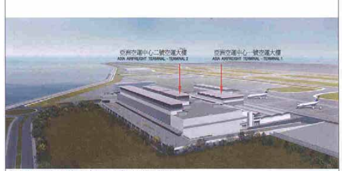
從東南面望向亞洲空運中心二號空運大樓的構思圖 VIEW OF THE ASIA AIRFREIGHT TERMINAL 2 FROM SOUTH-EAST DIRECTION (ARTIST'S IMPRESSION)