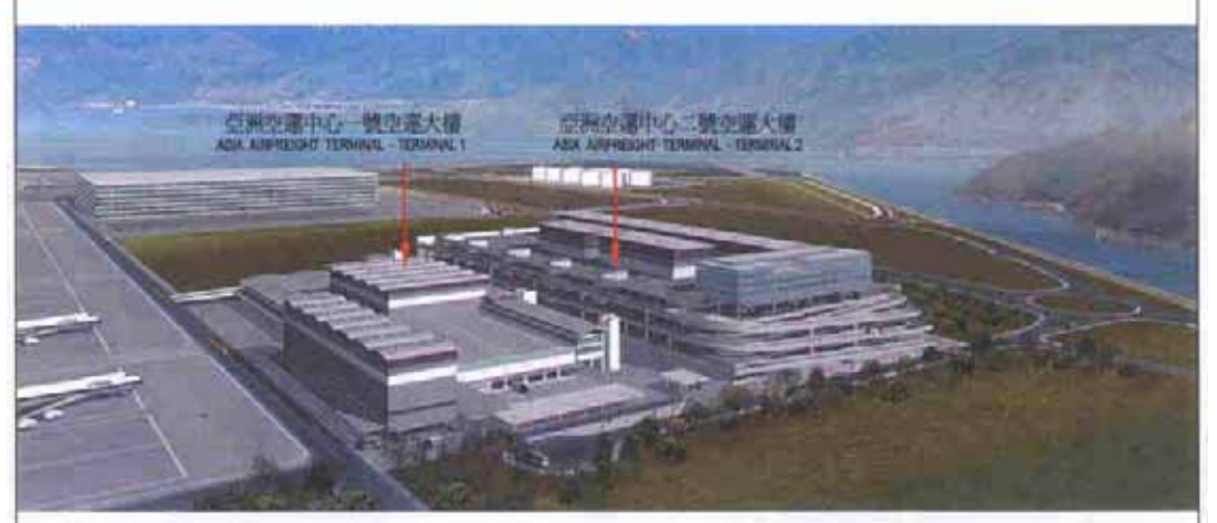
從西北面望向亞洲空運中心二號空運大樓的構思圖 VIEW OF THE ASIA AIRFREIGHT TERMINAL 2 FROM NORTH-WEST DIRECTION (ARTIST'S IMPRESSION)