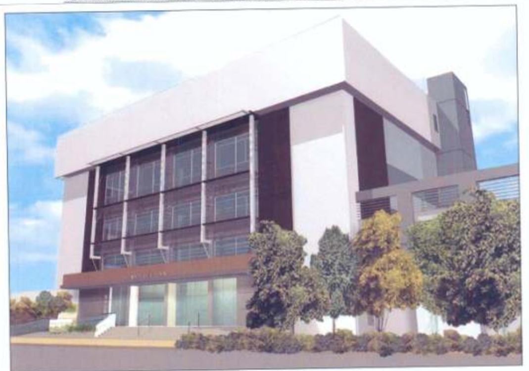
從南面望向勞賽審載處的構思圖 VIEW OF THE PROPOSED LABOUR TRIBUNAL BUILDING FROM SOUTHERN DIRECTION (ARTIST'S IMPRESSIOIN)