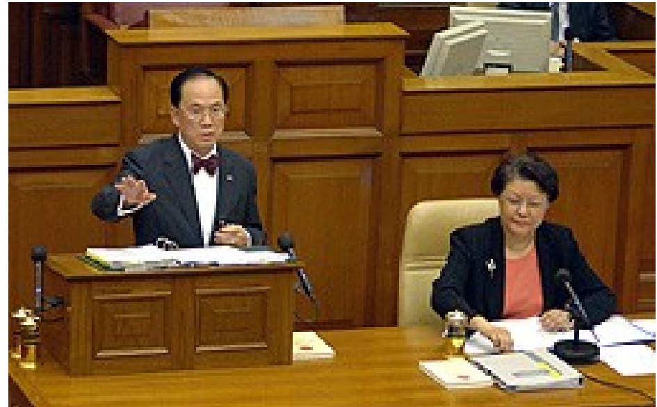
CEO Mr. Donald Tsang in LegCo, 11 July 2006, Energy Speech.