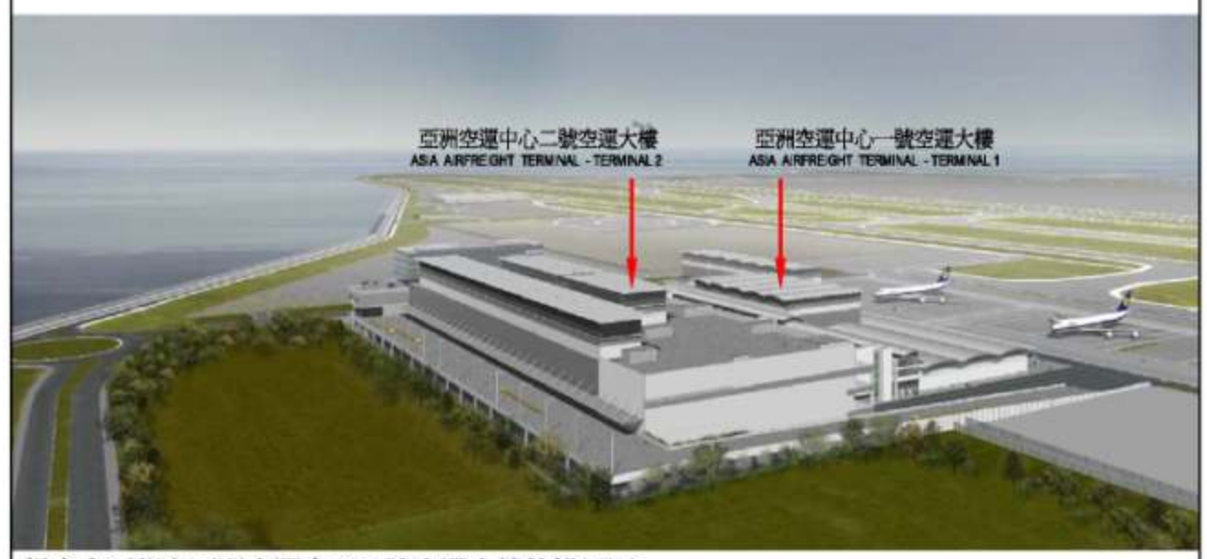
從東南面望向亞洲空運中心二號空運大樓的構思圖 VIEW OF THE ASIA AIRFREIGHT TERMINAL 2 FROM SOUTH-EAST DIRECTION (ARTIST'S IMPRESSION)