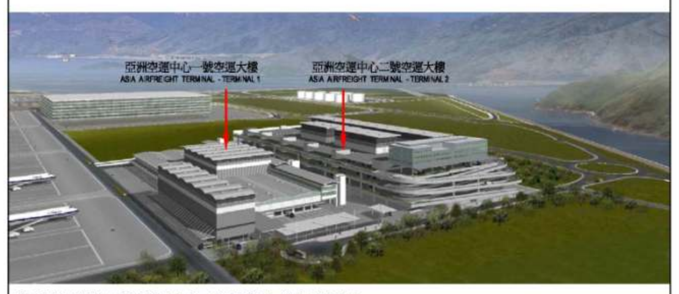
從西北面望向亞洲空運中心二號空運大樓的構思圖 VIEW OF THE ASIA AIRFREIGHT TERMINAL 2 FROM NORTH-WEST DIRECTION (ARTIST'S IMPRESSION)