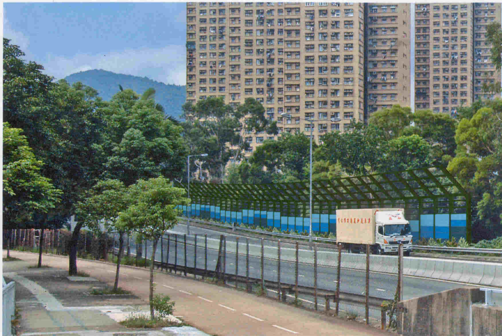
工務計劃項目第 7 7 6 T H 號 - 大埔完善路加建隔音屏障工程 (修訂方案) PWP Item No. 776TH - Retrofitting of Noise Barriers on Yuen Shin Road, Tai Po (Revised Scheme)