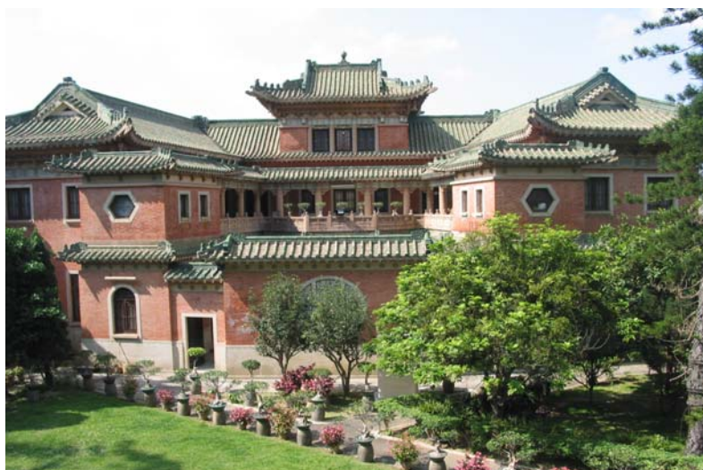
The Building at 45 Stubbs Road