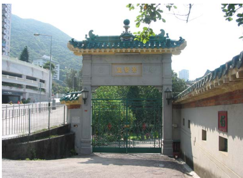
Entrance of the Building