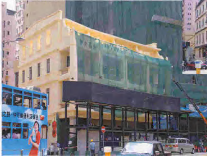
Wo Cheung Pawn Shop, Johnston Road