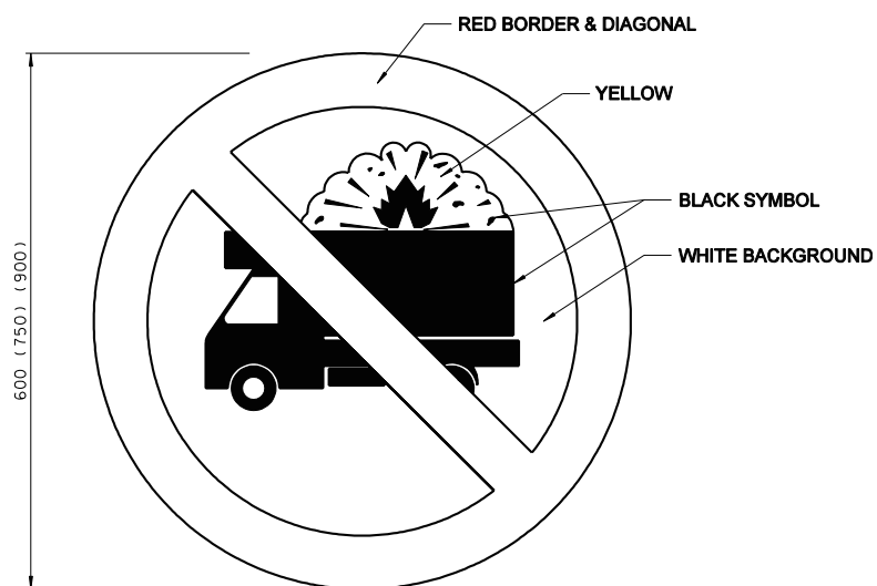
FIGURE No. 174