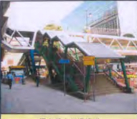
現有行人天橋樓梯 EXISTING FOOTBRIDGE STAIRCASE