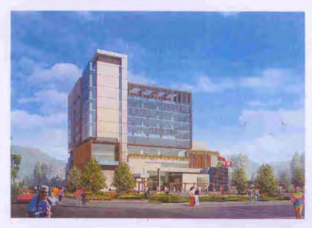
綜合大樓西面構思圖 VIEW OF THE PROPOSED DEVELOPMENT FROM WESTERN DIRECTION (ARTIST'S IMPRESSION)