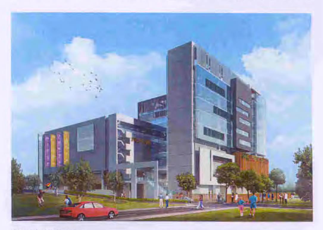
綜合大樓北面構思圖 VIEW OF THE PROPOSED DEVELOPMENT FROM NORTHERN DIRECTION (ARTIST'S IMPRESSION)