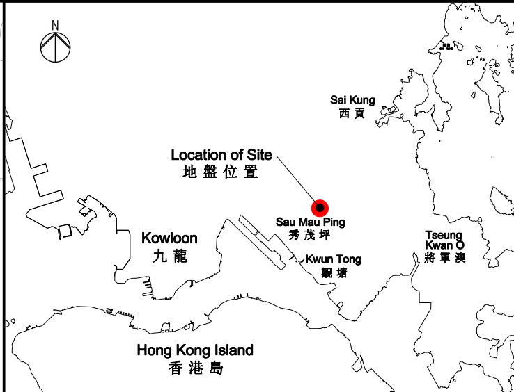
Location Plan 位置圖