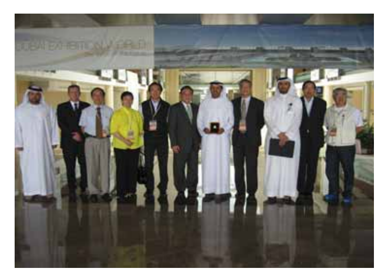
Presentation of souvenir to representatives of DWTC(LLC) at DICEC