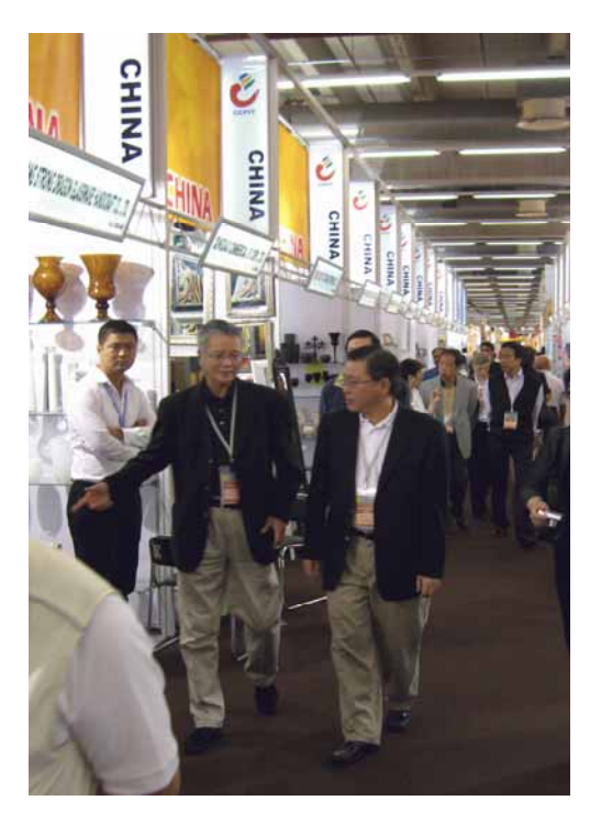
The delegation visited booths of Chinese exhibitors in Tendence Lifestyle