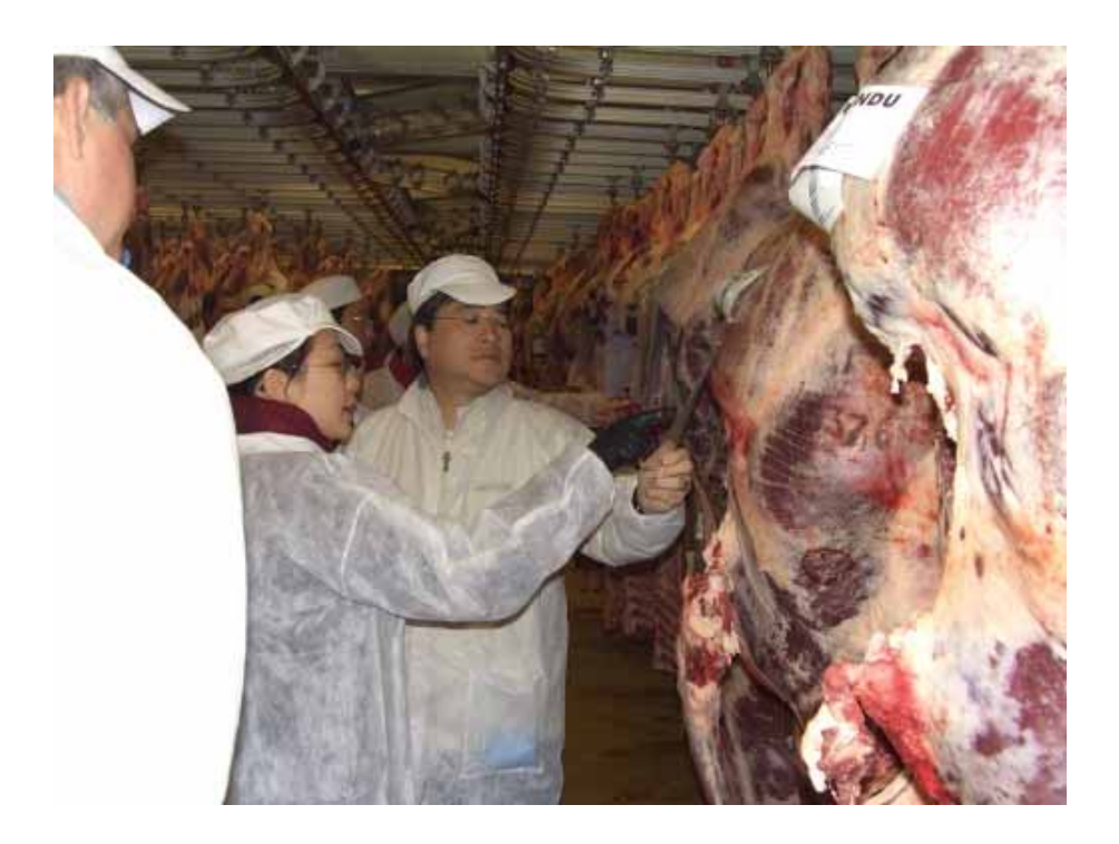
Briefing on the labelling system of beef cattle at Min Rungis

2.23 The delegation has also received a briefing on the work of France Vétérinaire International (FVI), created in 2003 and which is set up to coordinate veterinary training and technical cooperation on animal health issues. Under the form of a public interest group, it is charged of unifying, coordinating and promoting the expertise of the French veterinarians on an international level.