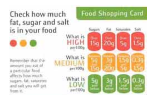
Figure 3 - Food shopping card in real size published jointly by FSA and "Which?"