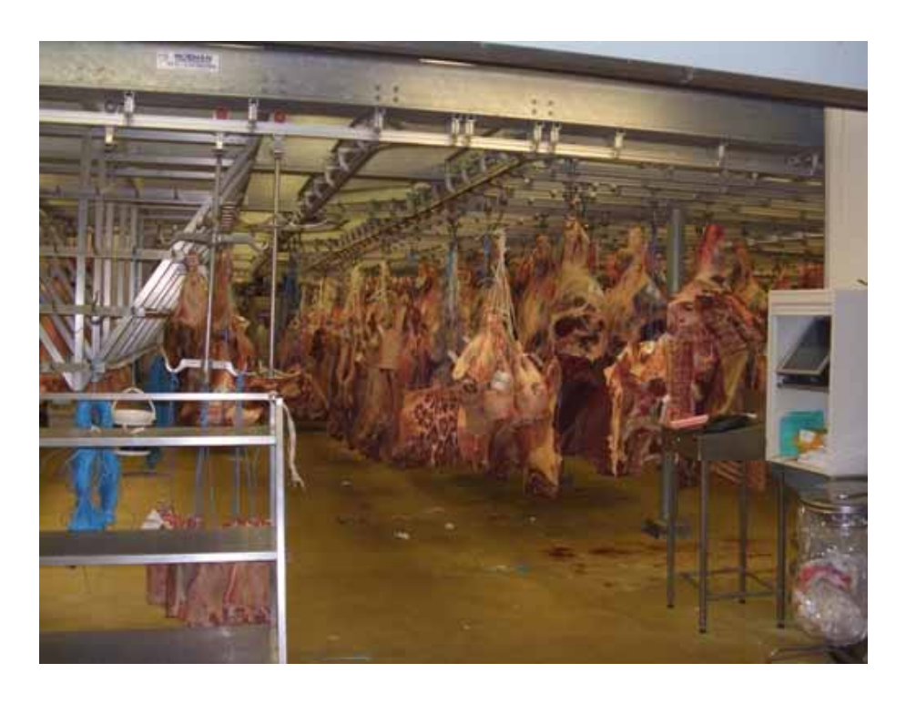
A meat hall at MIN Rungis