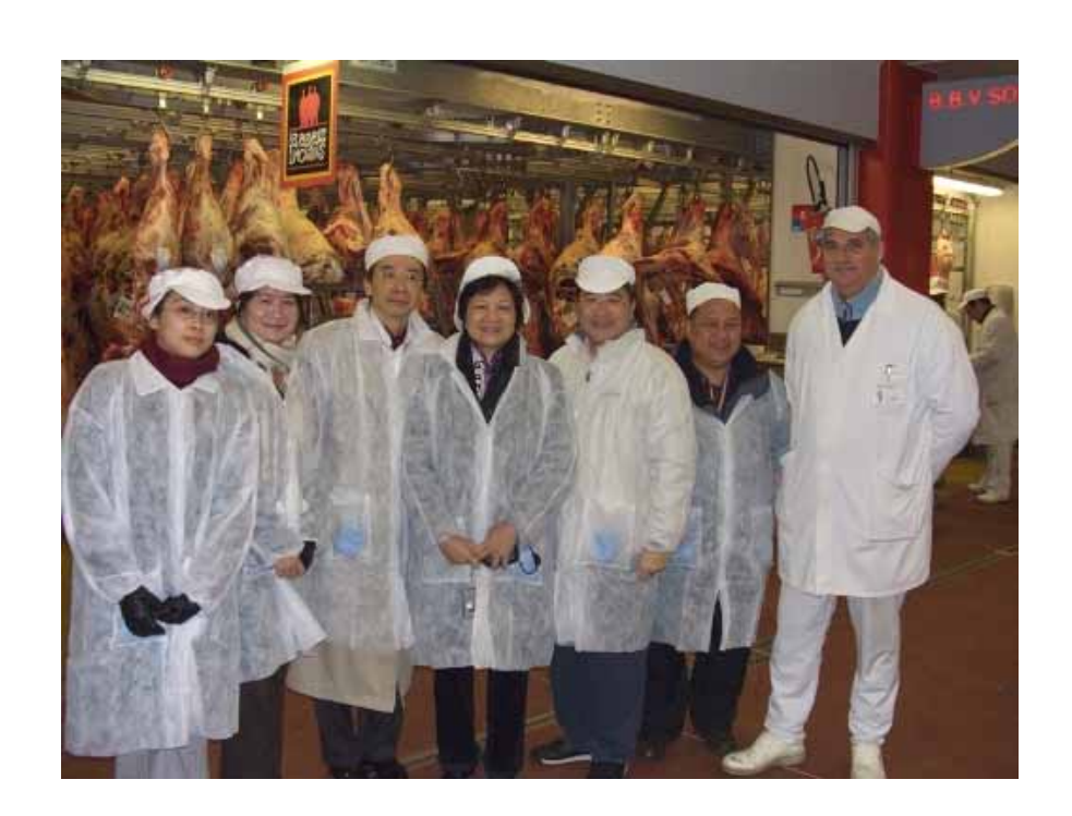
Visit to MIN Rungis wholesale market in Paris