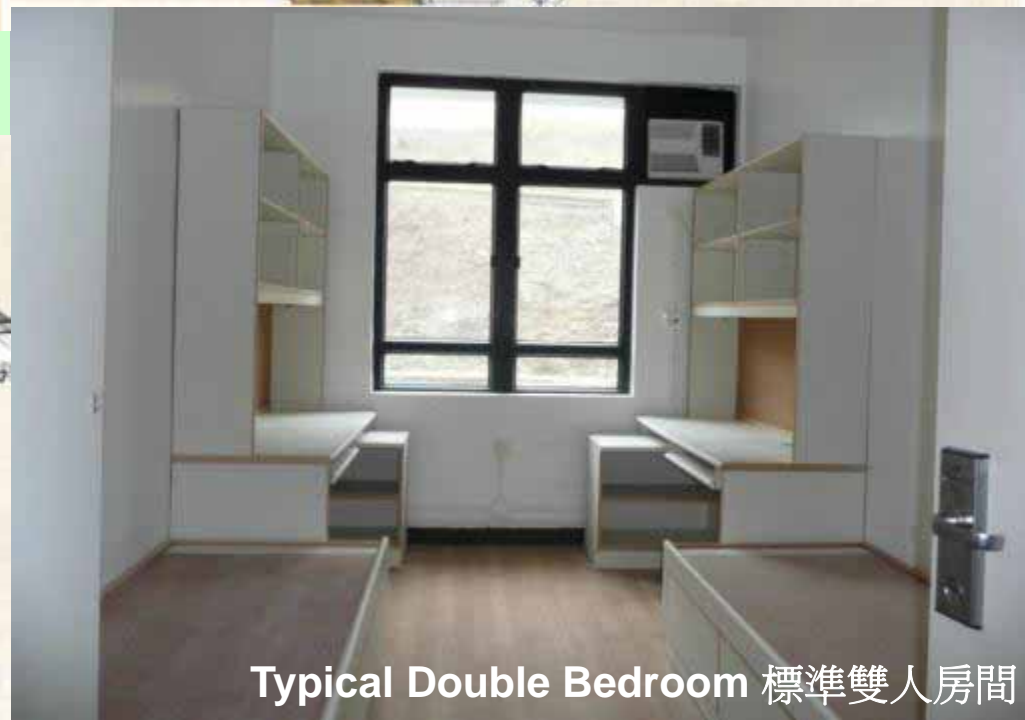
Typical Double Bedroom 標準雙人房間