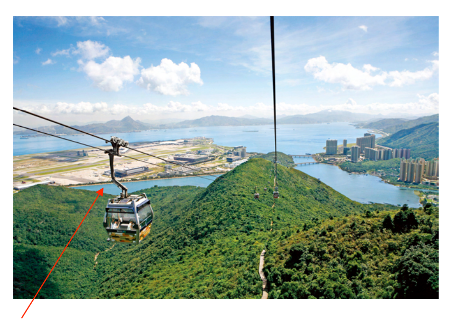
The proposed route of the HKLR will create an eyesore that will be damaging to tourist business created by attractions such as the Ngong Ping 360 cable car.