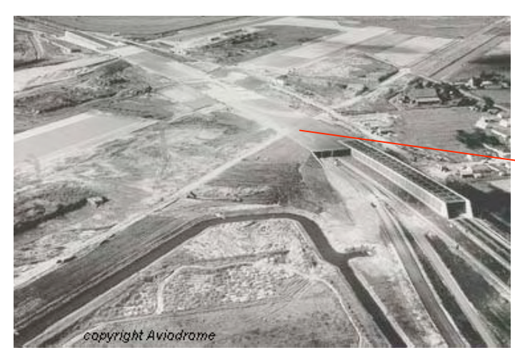
Part of the Netherlands A4 road is the Schipholtunnel, which crosses the Buitenveldert landing strip of Schiphol airport

Comparisons between Chep Lap Kok and Schiphol airports reveal that passenger numbers are similar: In 2007 CLK carried 47.8m passengers, and Schiphol carried 47.793m passengers. Schiphol is one of Europe's busiest cargo airports. If an airport of the size and complexity of Schiphol can run a safe and best in class airport with a major public road running via a tunnel under a runway, why cannot Hong Kong?