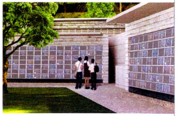
戶外靈灰龕的構思圖 VIEW OF THE OUTDOOR NICHES (ARTIST'S IMPRESSION)