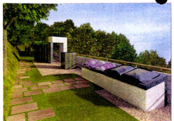
紀念花園的構思圖 VIEW OF THE GARDEN OF REMEMBRANCE (ARTIST'S IMPRESSION)

VIEW OF THE COLUMBARIUM AND GARDEN OF REMEMBRANCE FROM SOUTH-WEST DIRECTION (ARTIST'S IMPRESSION)