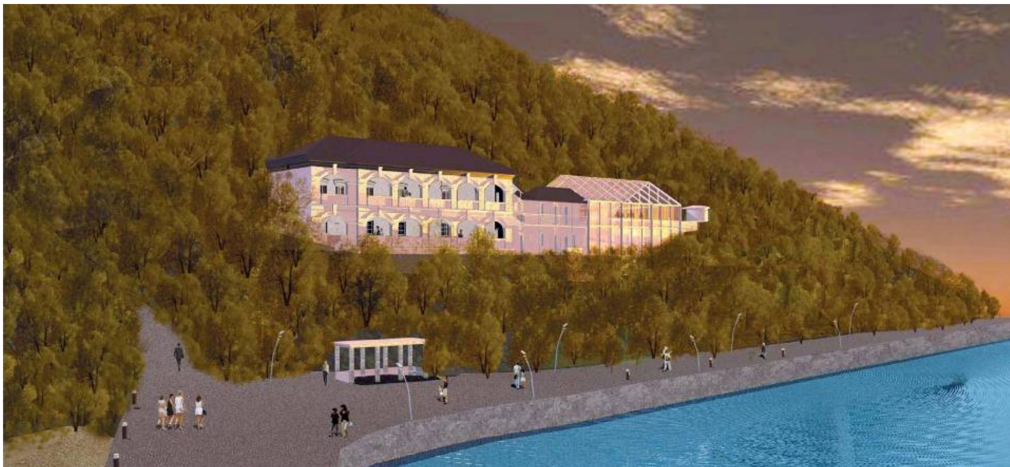
PERSPECTIVE OF TAI O HERITAGE HOTEL 大澳文物酒店透視圖

REVITALISATION SCHEME – CONVERSION OF OLD TAI O POLICE STATION INTO TAI O HERITAGE HOTEL 活化歷史建築伙伴計劃 – 改建舊大澳警署為大澳文物酒店