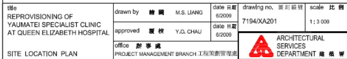
工地範圍 SITE BOUNDARY