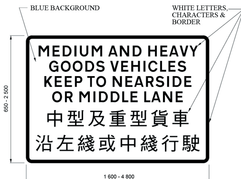
“FIGURE NO. 29