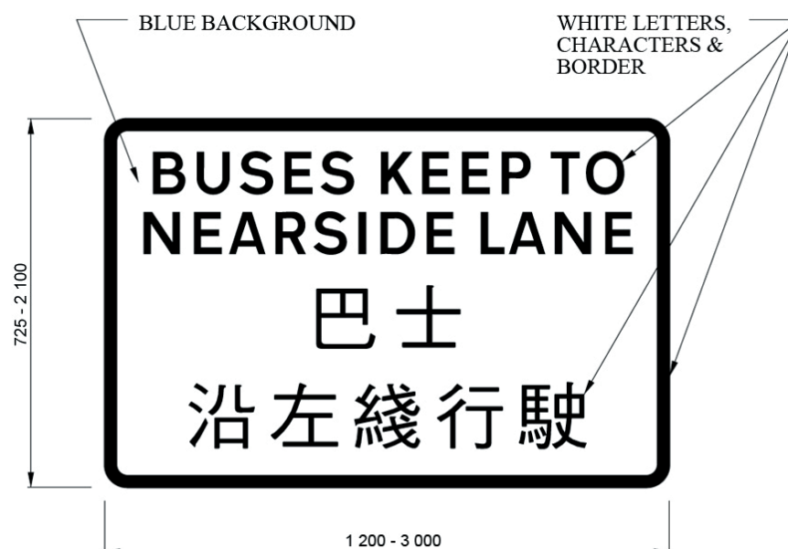
FIGURE NO. 30