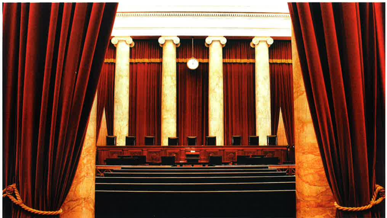
The nine chairs of the Justices lined up in the Court Chamber.

Ronald Coase [1991 Nobel Prize in economics] said of competition law, “when the prices went up the judges said it was monopoly, when the prices went down, they said it was predatory pricing, and when they stayed the same they said it was tacit collusion.” 1