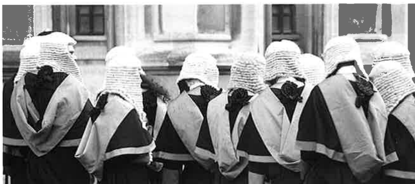
Can Judges second guess a market?