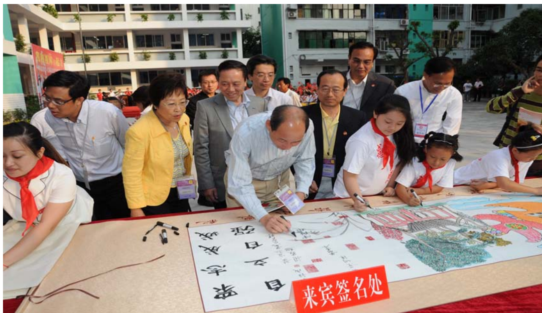
Members signed their names on the picture scroll drawn by students