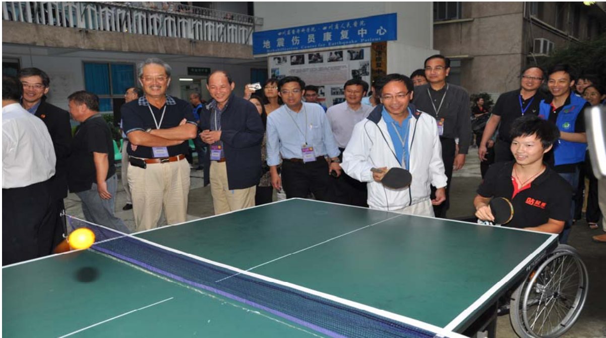
Members played table tennis with the rehabilitated