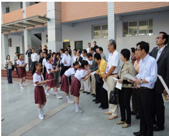
Students presented thank you cards to Members