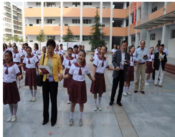
Members joined students in singing "A Grateful Heart"