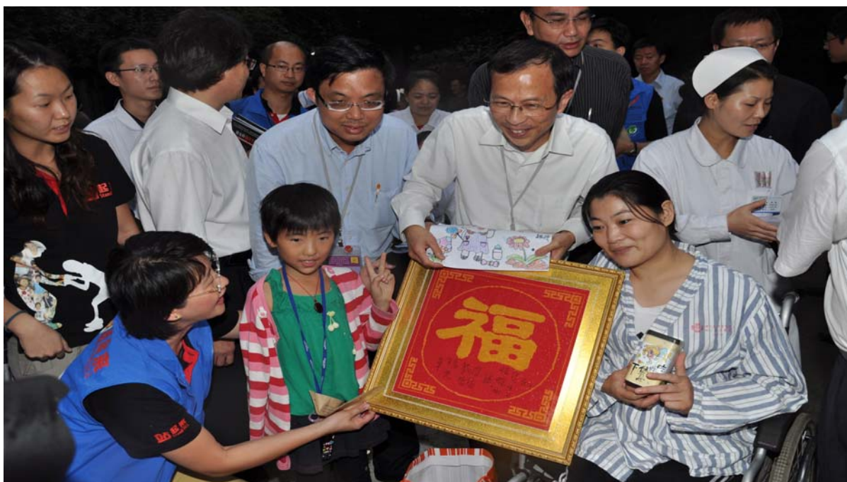
The Rehabilitation Centre for the Disabled presented Members with a cross-stitch picture featuring the word "fortune"