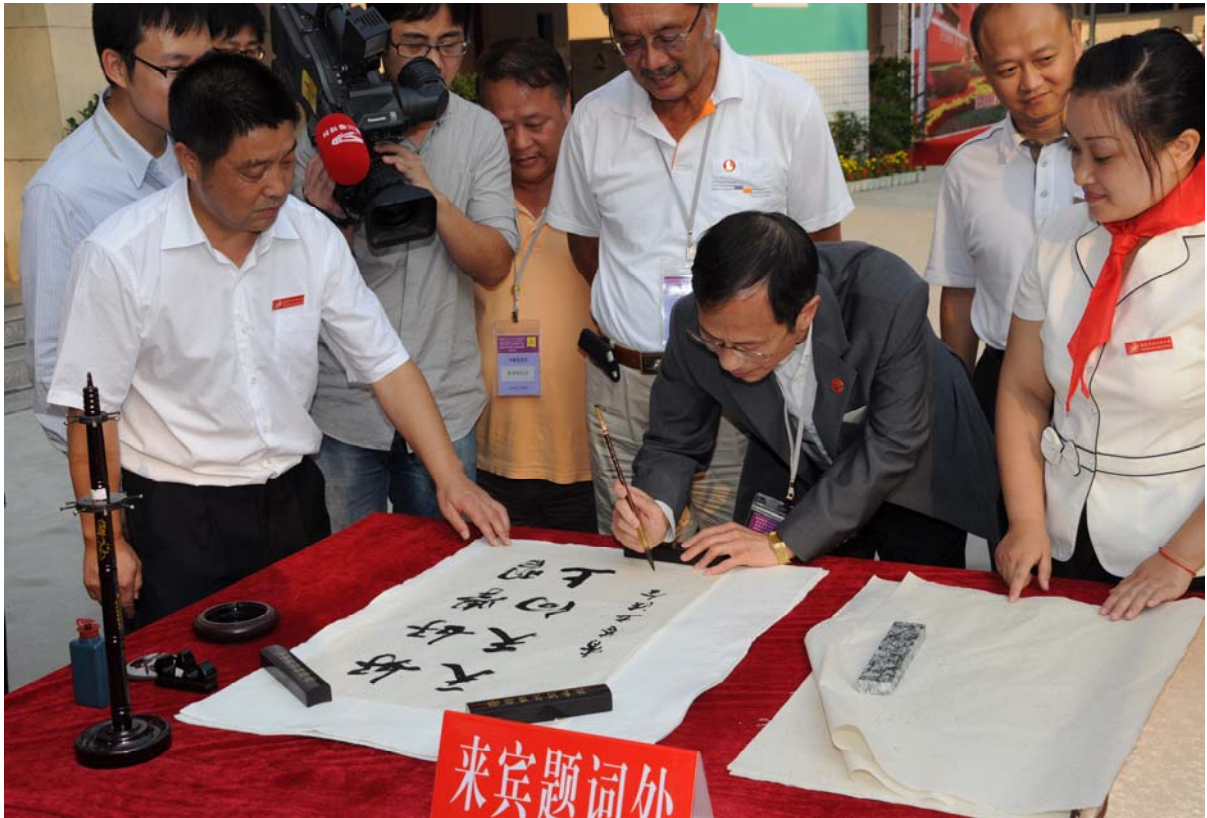
President Hon Jasper TSANG Yok-sing wrote a message in the form of calligraphy to encourage the students