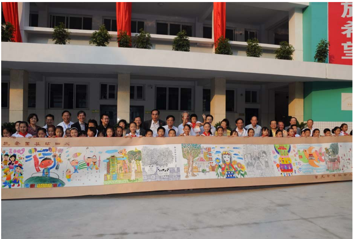
The long scroll of picture about the close relationship between Sichuan and Hong Kong drawn by students