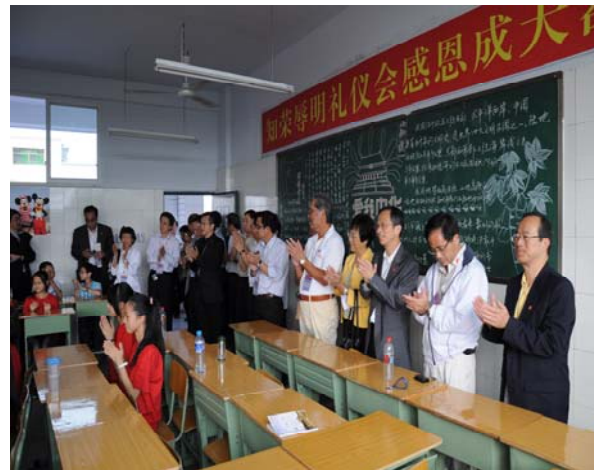
Members encouraged the performing students with applause