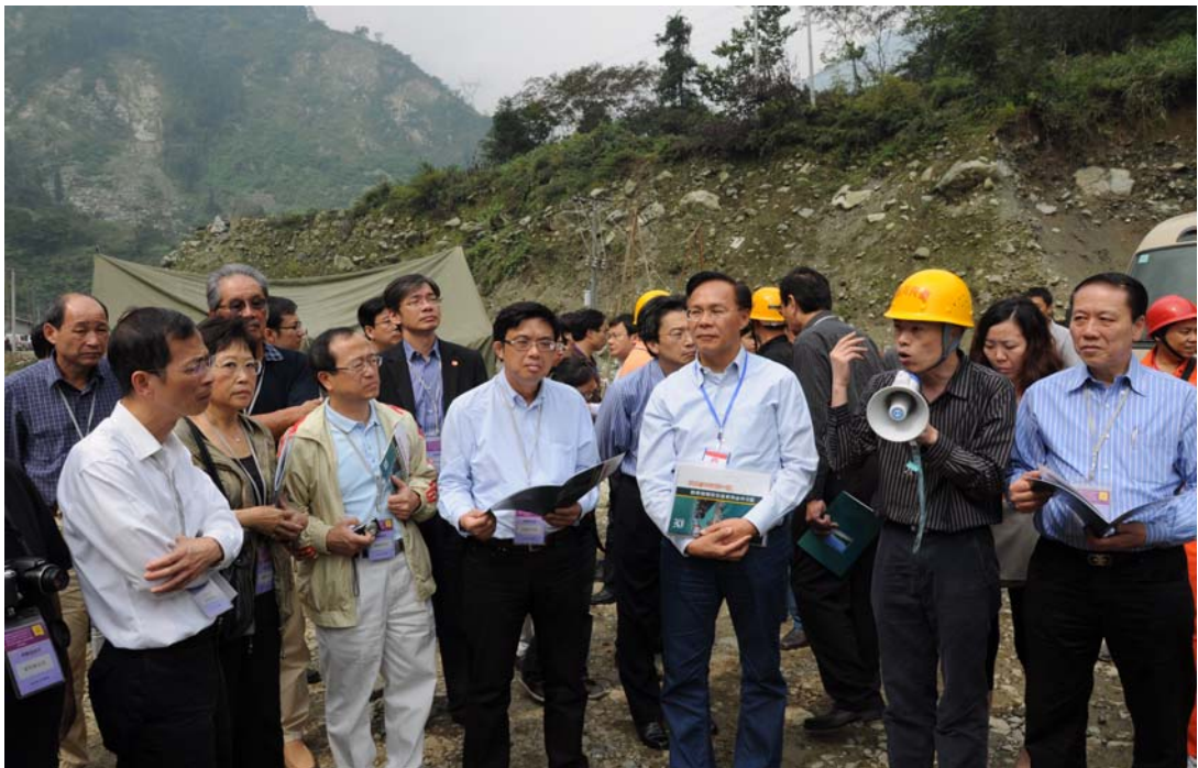
Members received a briefing from engineering staff working at the site of the Provincial Road 303

huge threats to the works safety of the project. Since late June this year, the area had experienced several huge rainstorms that were rarely seen in history. In addition, disasters like falling stones, landslips and debris flow incidents also took place very frequently, disrupting transportation and seriously hindering the post-quake reconstruction projects. The engineering staff working at the site informed Members that the relevant units were held responsible for the quality, progress and safety management of their respective project items, thereby ensuring that the post-quake reconstruction of the carriageway could be completed within the scheduled timeframe and of good quality, and that works safety would always be put in the first place.