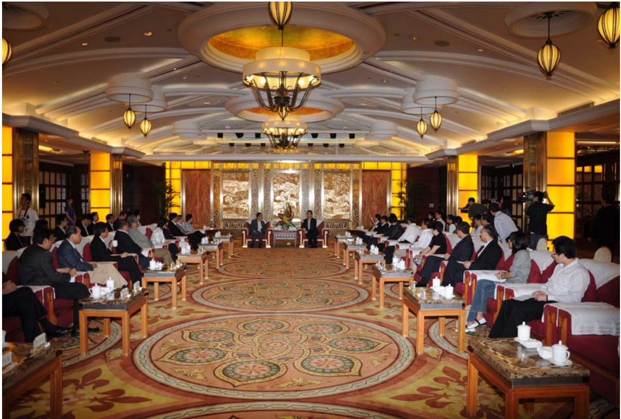
Members received a briefing from leaders of Sichuan Province on the reconstruction work