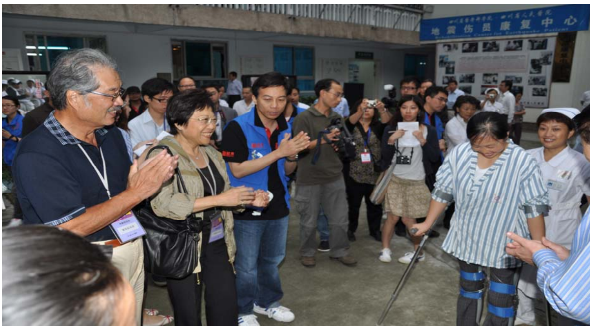
Members clapped hands to show support for the rehabilitated who practised walking with prostheses