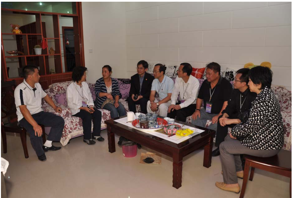
Members visited the residents to gain a better understanding of their post-quake living conditions