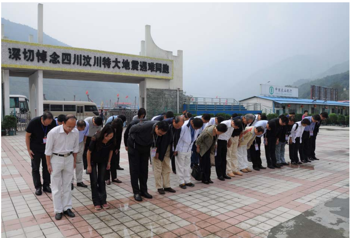
Members paid tribute to the earthquake victims in the front yard of the site of Xuankou Middle school