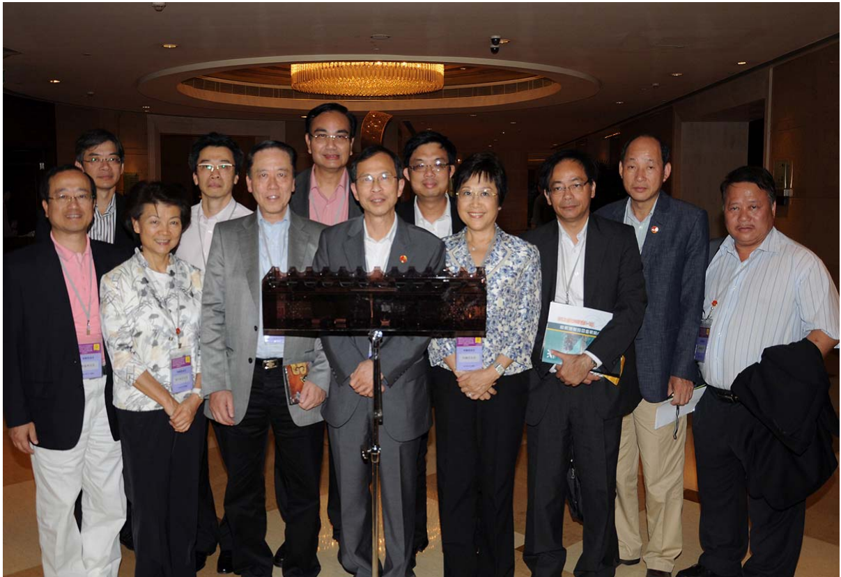
After the meeting with leaders of Sichuan Province, Members briefed reporters on the contents of the meeting and answered their questions