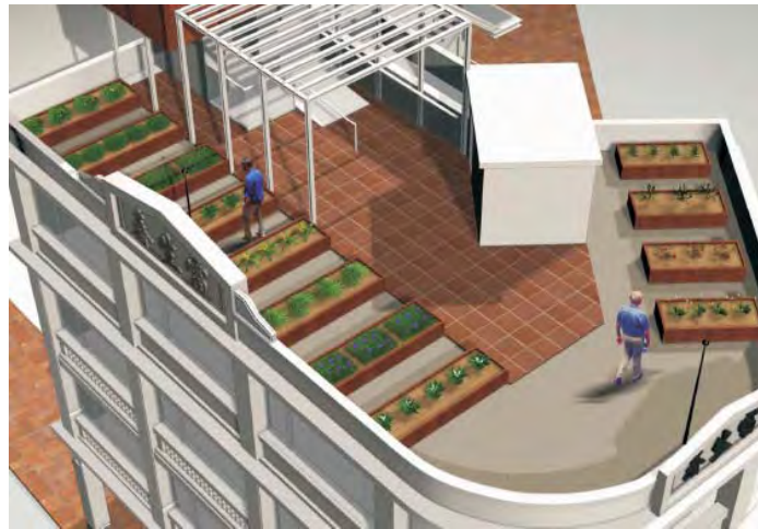
Artistic Impressions of the City Hostel 活化後模擬圖片

Revitalisation Scheme – Revitalising Lui Seng Chun as the HKBU Chinese Medicine and Healthcare Centre 活化歷史建築伙伴計劃 - 活化雷生春為香港浸會大學中醫藥保健中心