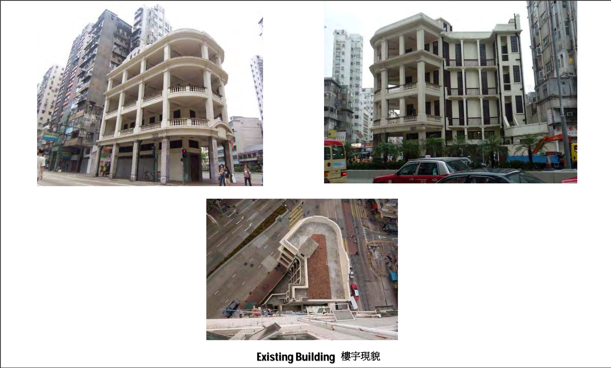
Existing Building 樓宇現貌

Revitalisation Scheme – Revitalising Lui Seng Chun as the HKBU Chinese Medicine and Healthcare Centre 活化歷史建築伙伴計劃 - 活化雷生春為香港浸會大學中醫藥保健中心