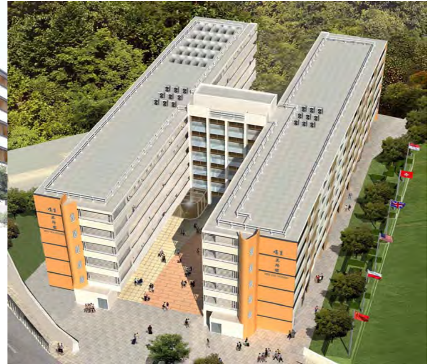
Artistic Impressions of the City Hostel 活化後模擬圖片

Revitalisation Scheme – Revitalising Mei Ho House as City Hostel 活化歷史建築夥伴計劃 – 活化美荷樓為城市旅舍