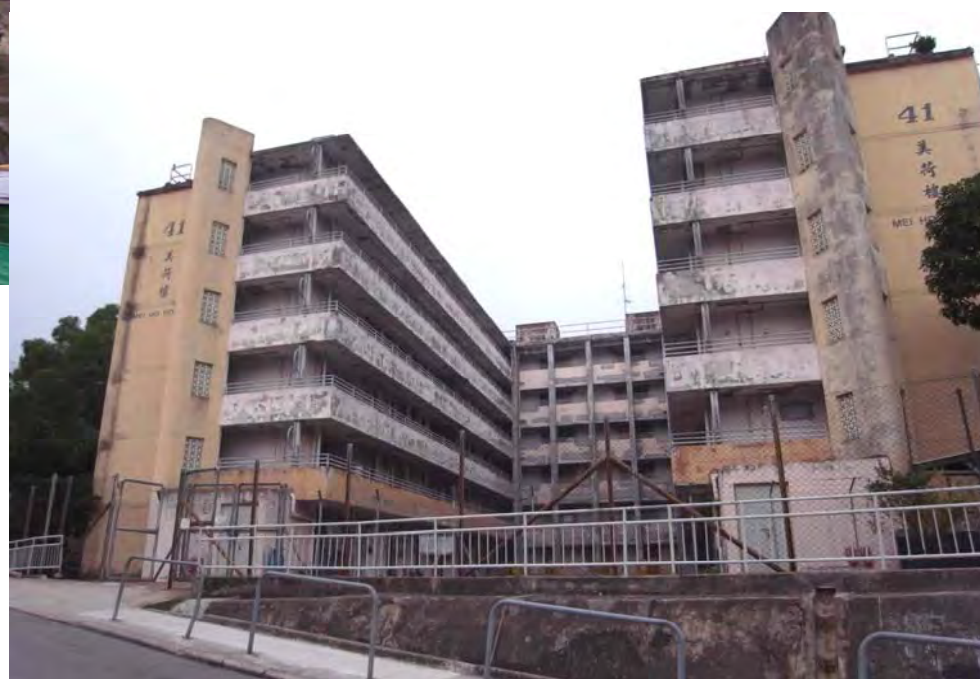
Existing Building 樓宇現貌

Revitalisation Scheme – Revitalising Mei Ho House as City Hostel 活化歷史建築夥伴計劃 – 活化美荷樓為城市旅舍