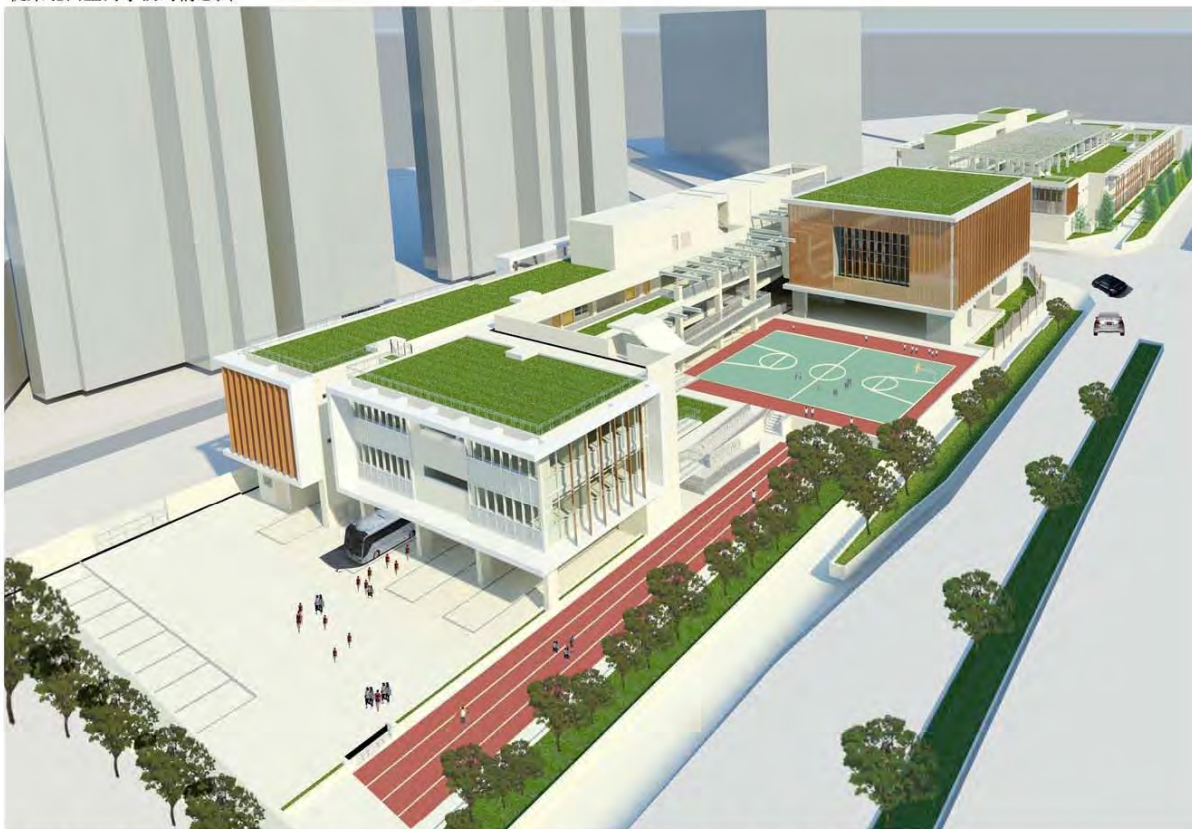
VIEW OF THE BOARDING BLOCK FROM SOUTH-WESTERN DIRECTION (ARTIST'S IMPRESSION) 從西南面望向宿舍的構思圖