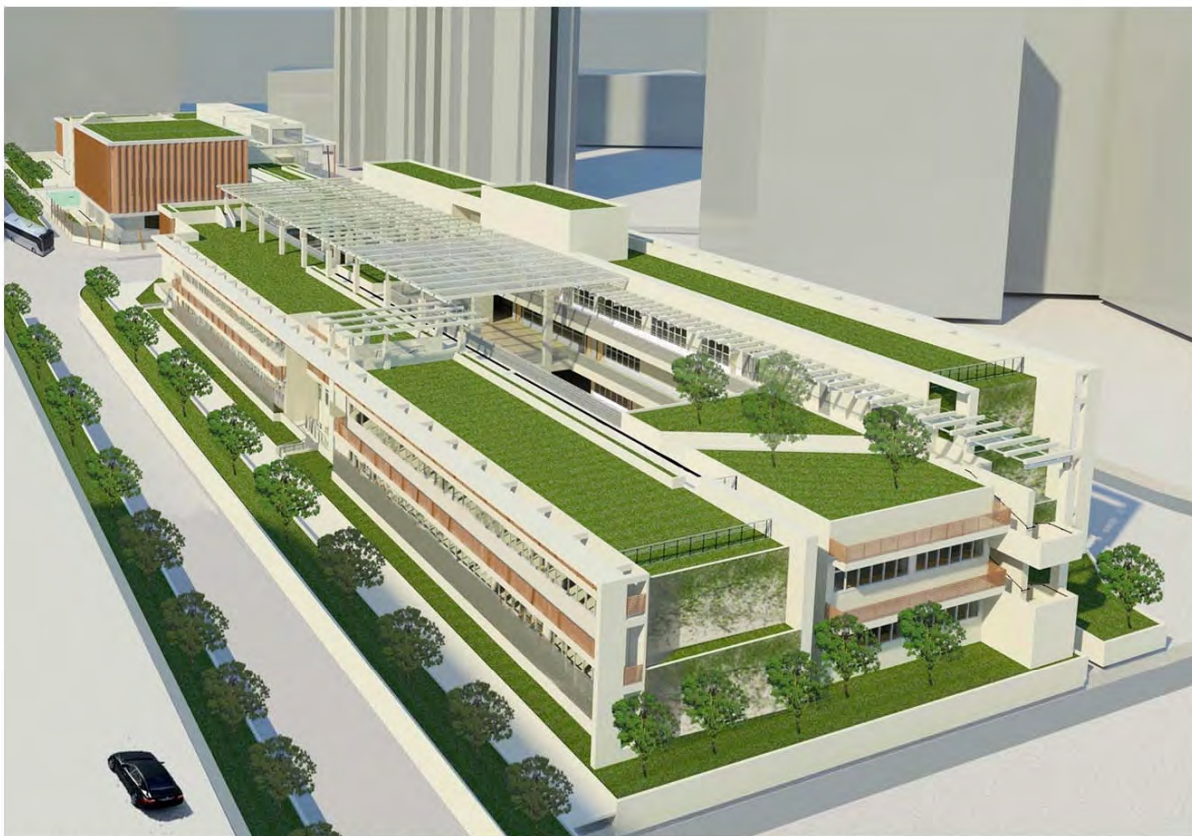
VIEW OF THE SCHOOL BLOCK FROM THE NORTH-EASTERN DIRECTION (ARTIST'S IMPRESSION) 從東北面望向學校的構思圖