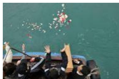
Scattering of flower petals