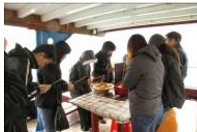
Holding a simple memorial service