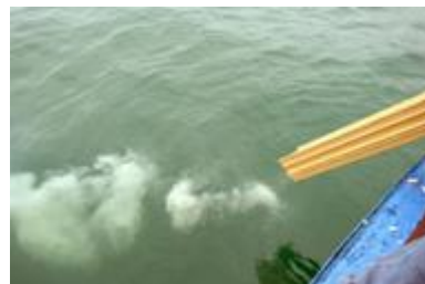
Scattering of cremains