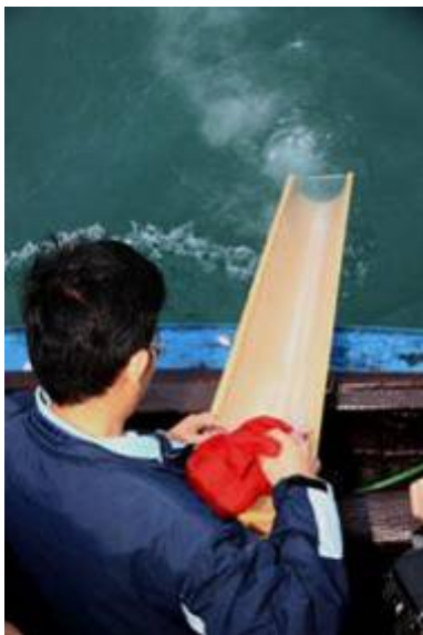
Scattering of cremains