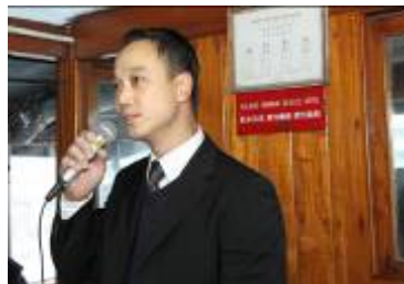
Master of Ceremonies