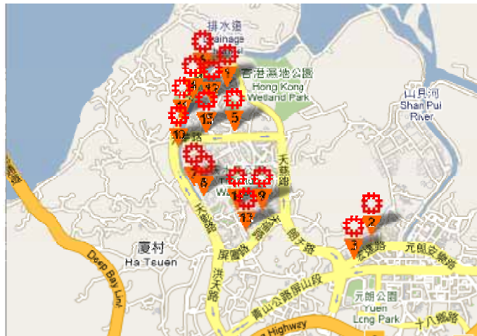
Yuen Long (including Tin Shui Wai) (12 housing estates)