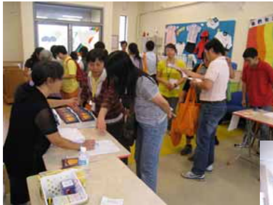
Despatched mooncakes to share the joy of Mid-autumn Festival