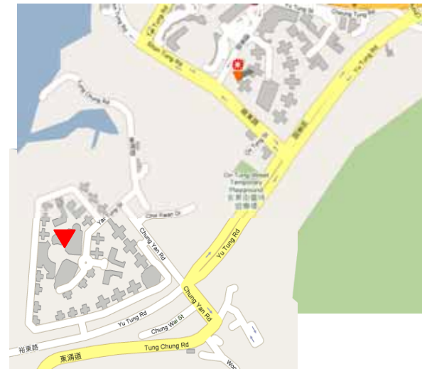
Tung Chung (2 housing estates)