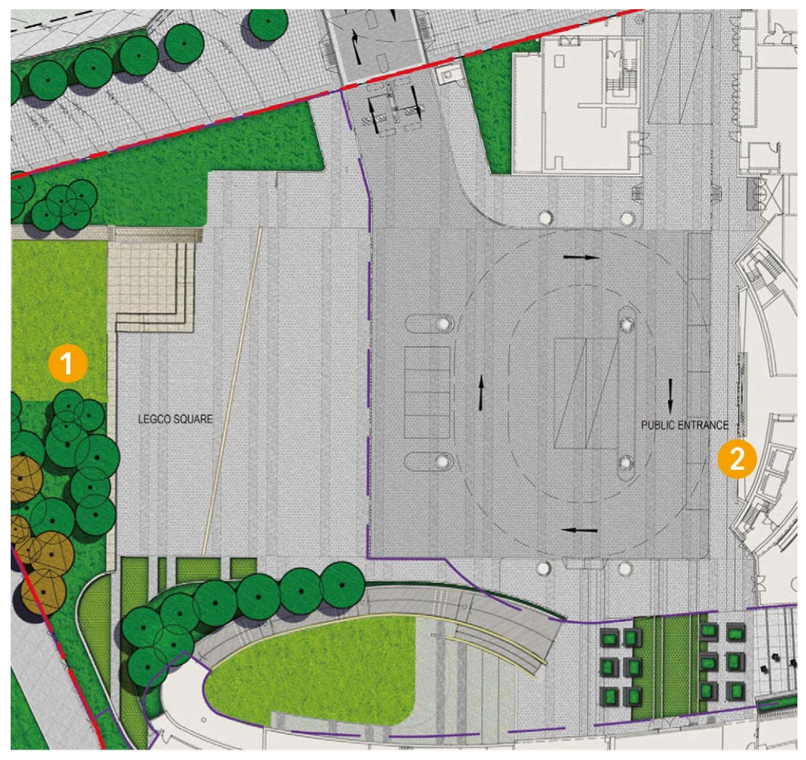
Locations at LegCo Square and outside Main Lobby of Council Block for displaying artworks.