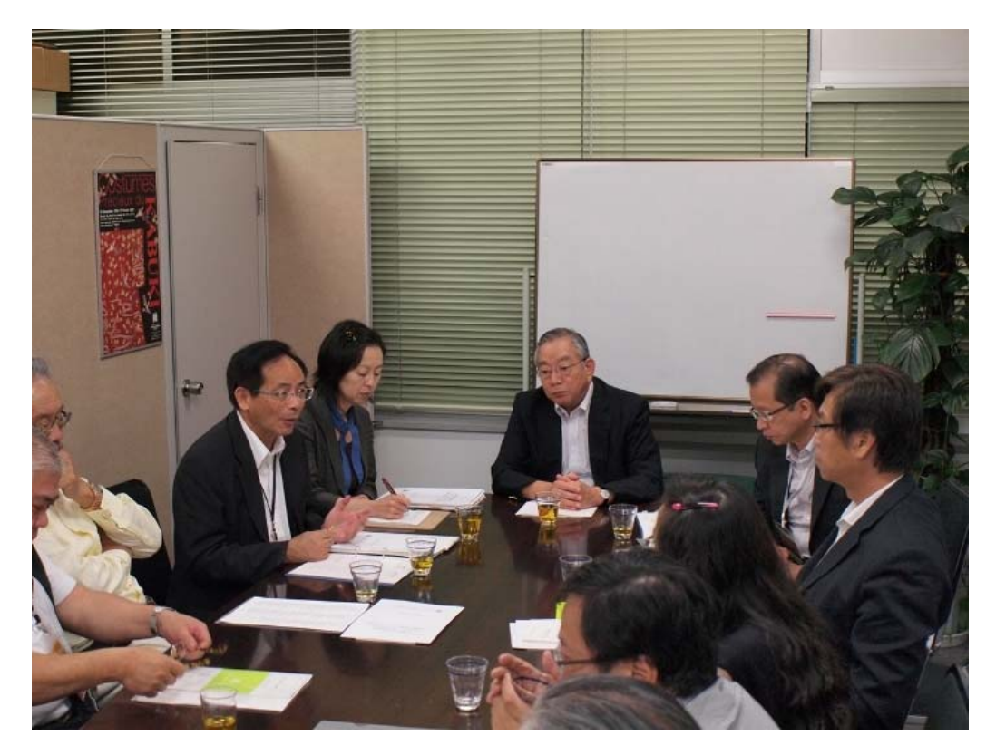
The delegation had a meeting with the Association for Corporate Support of the Arts Japan .