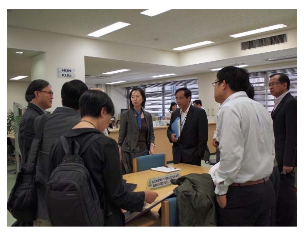
The delegation toured the library of the National Theatre.