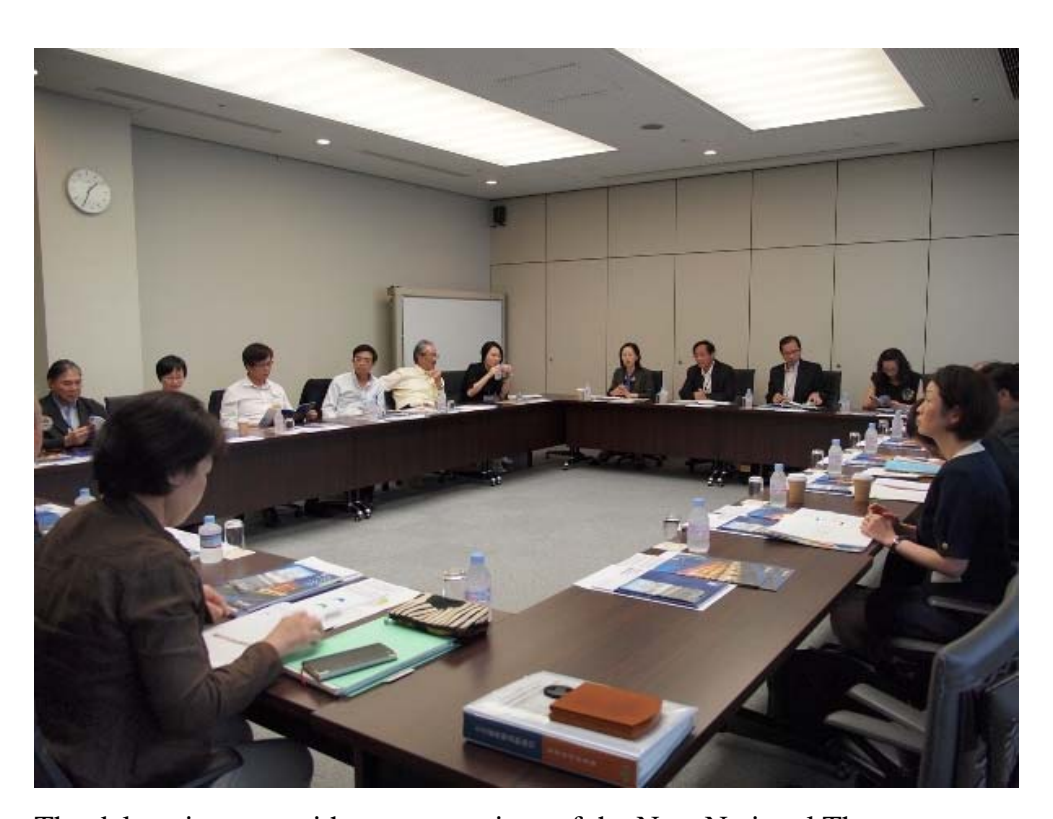
The delegation met with representatives of the New National Theatre.