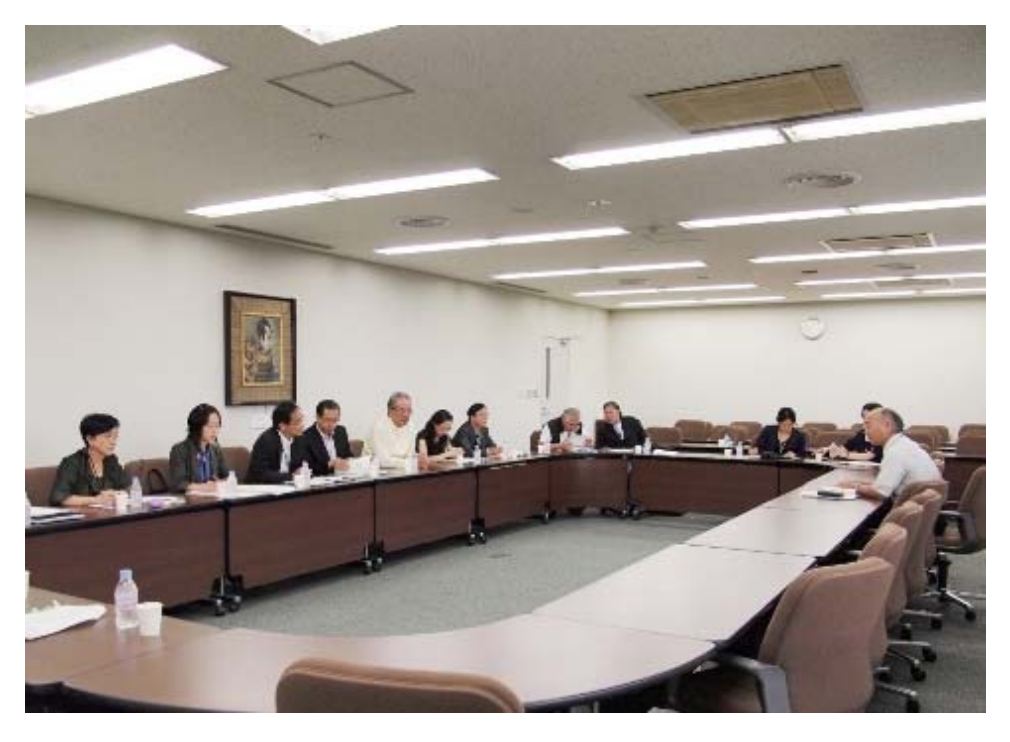
The delegation visited the Japan Arts Council.