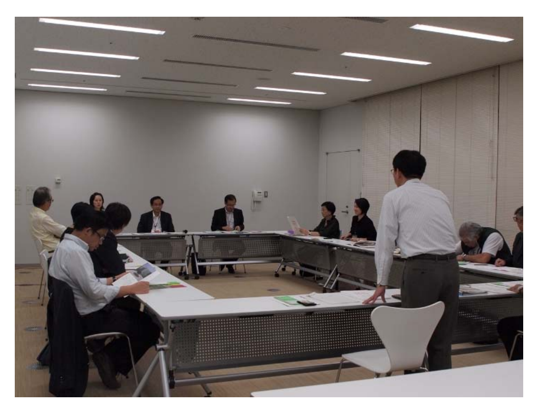
The delegation met with representatives of the National Art Center.