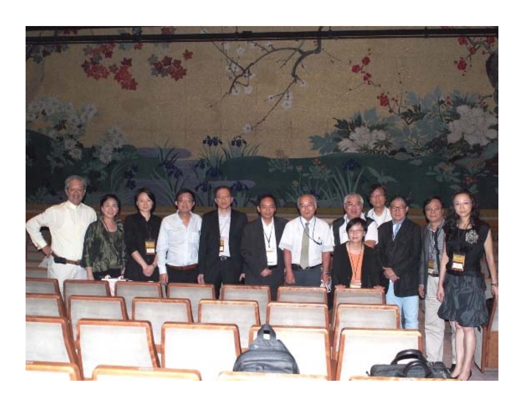
Group photo at the National Theatre.