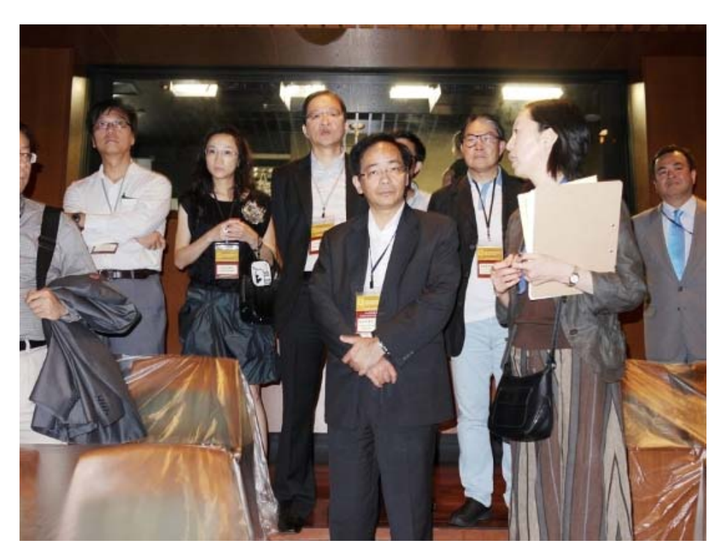
The delegation toured the facilities at the New National Theatre.