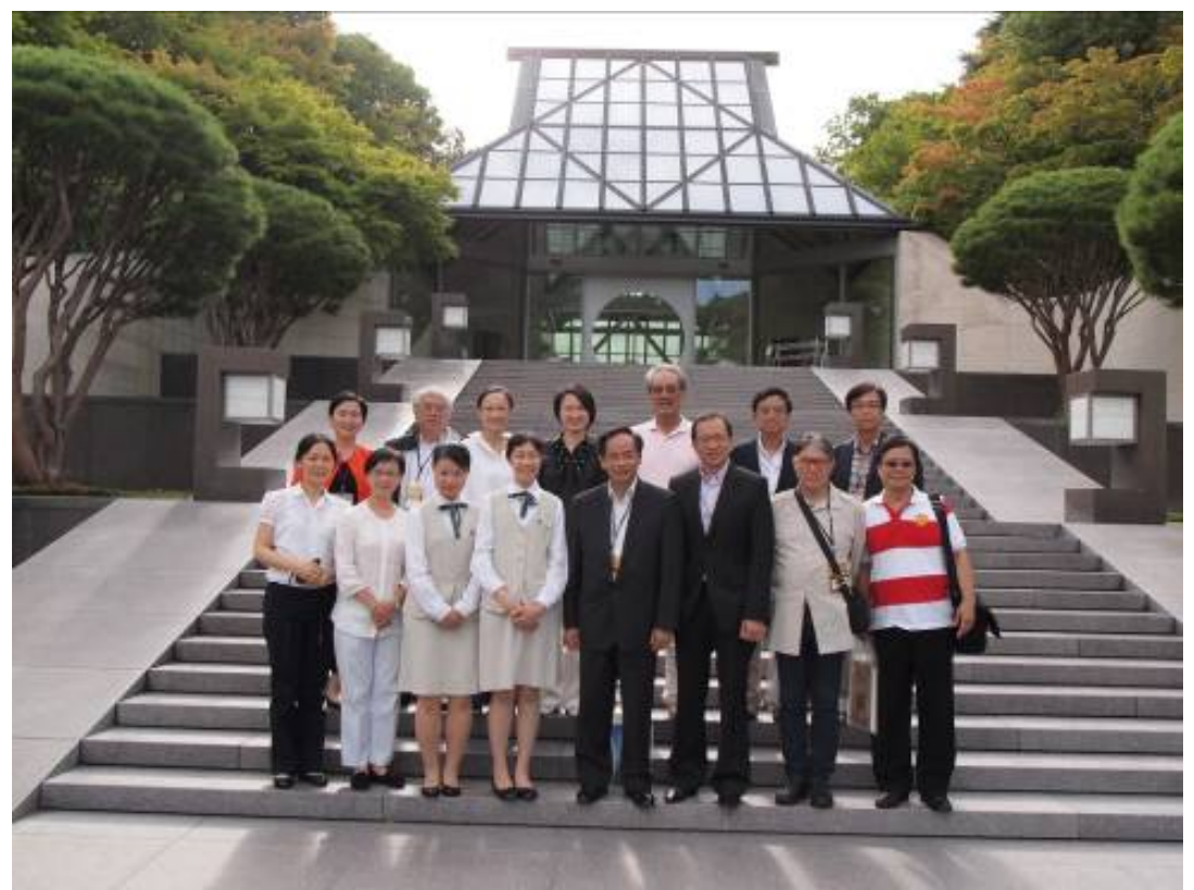
Group photo of the delegation at the Miho Museum.