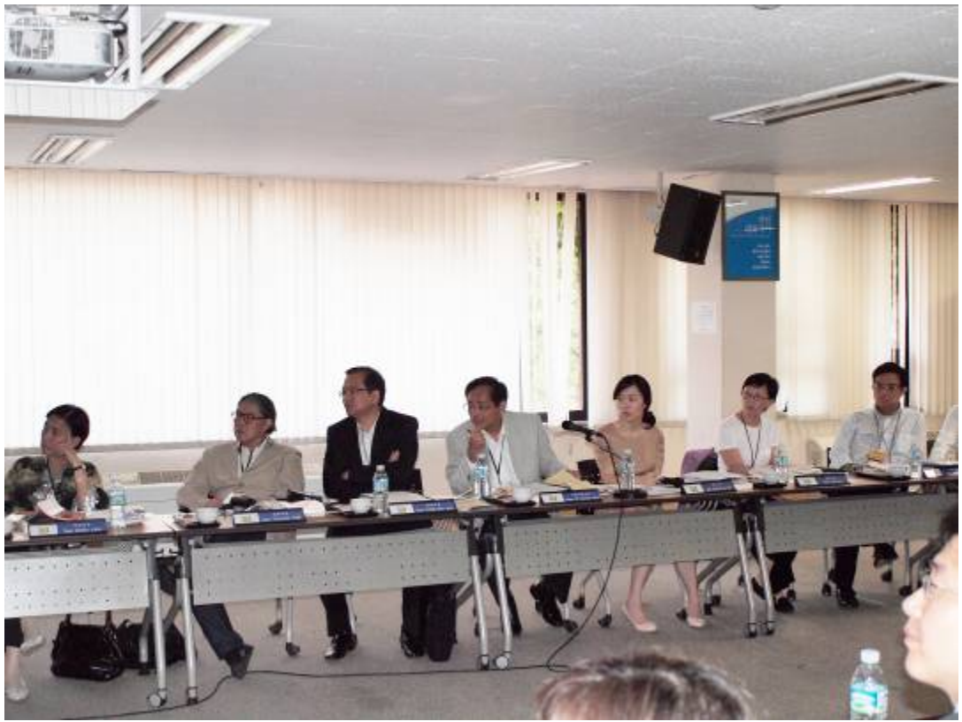
The delegation visits the Korea Arts & Culture Education Service.