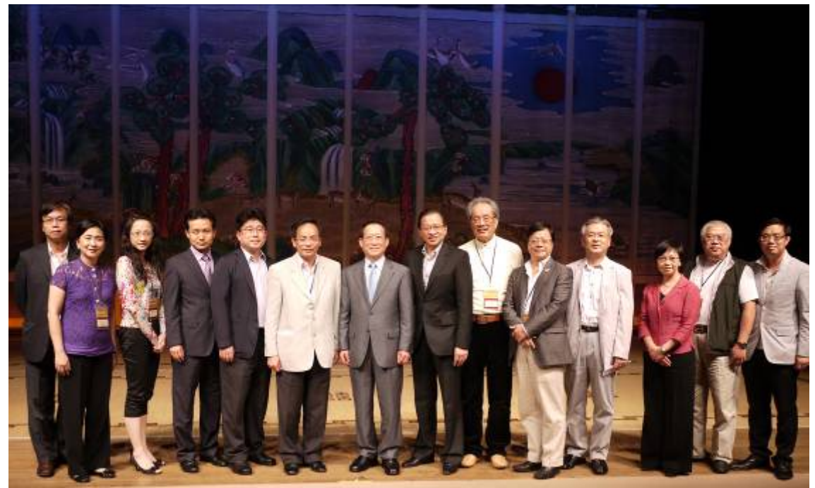
Group photo of the delegation and representatives of the National Centre for Korean Traditional Performing Arts.