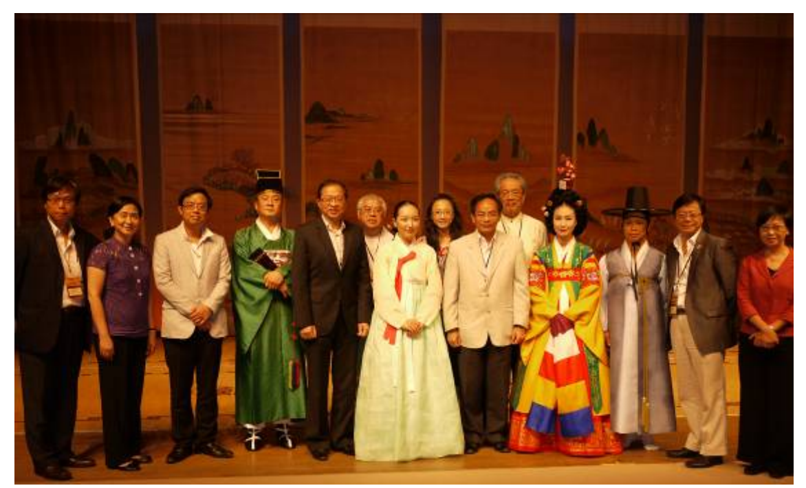
Group photo of the delegation and artists performing traditional music and dance at the National Centre for Korean Traditional Performing Arts.