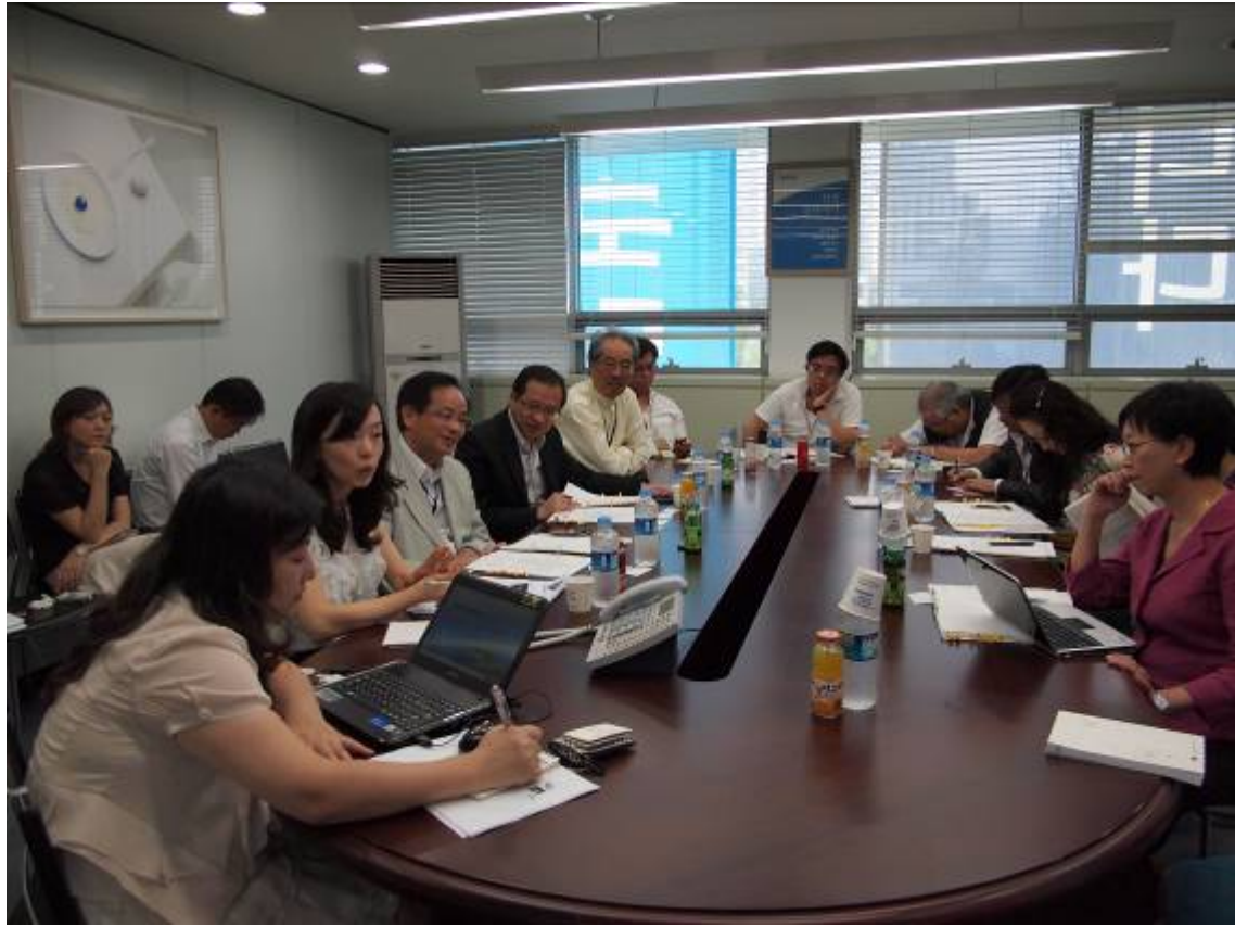
The delegation visits the Ministry of Culture, Sports and Tourism.