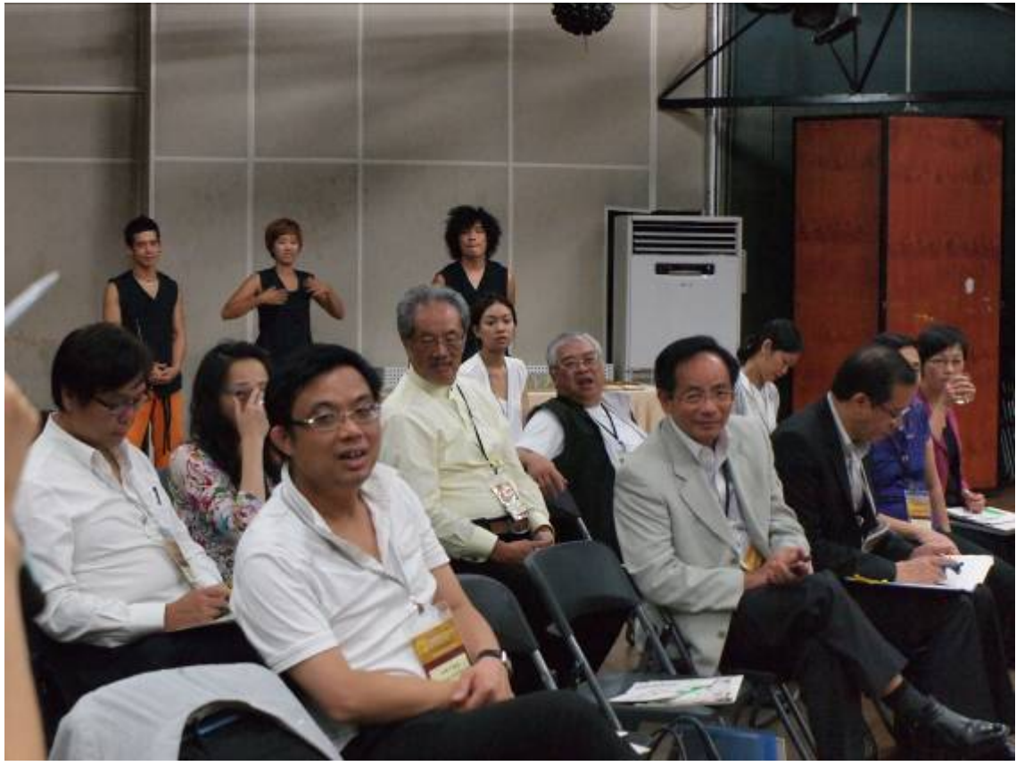
The delegation enjoys an arts performance at the Noridan & Haja Foundation.