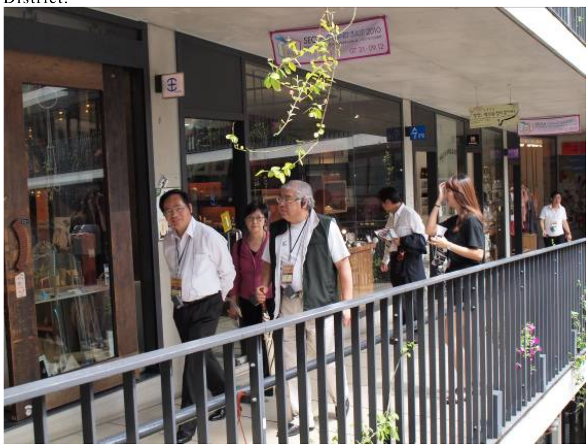
The delegation tours the Insa-dong Cultural District.