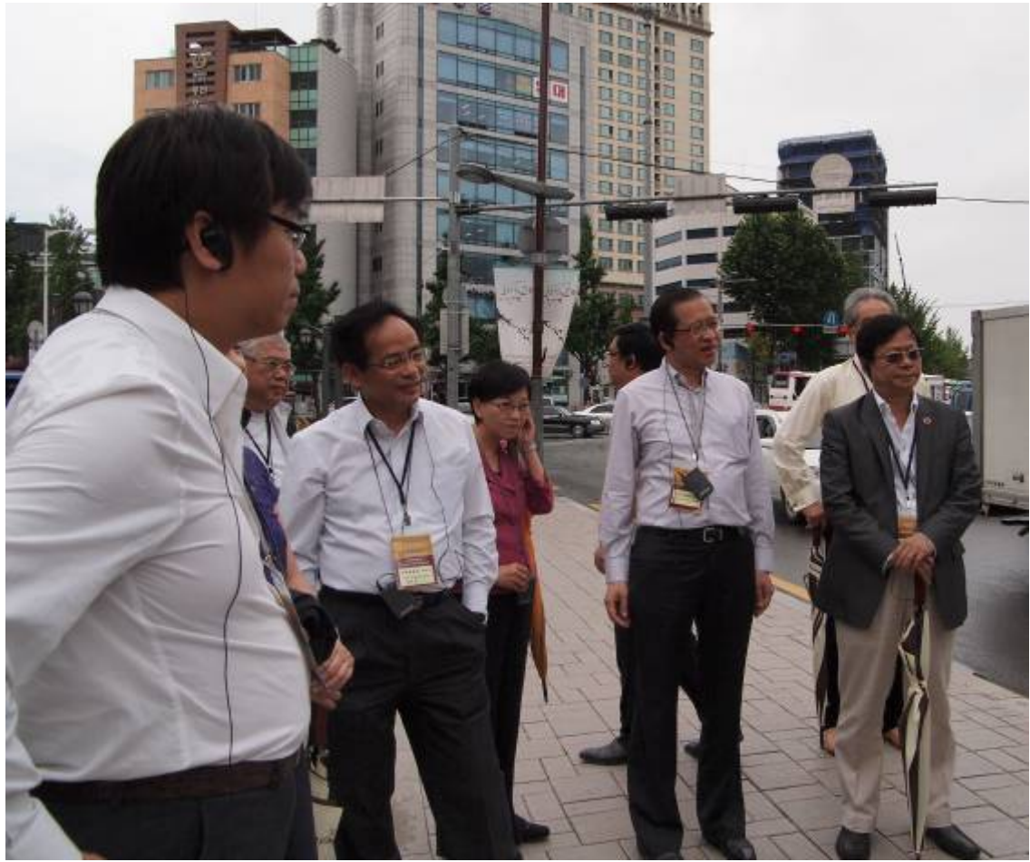
The delegation received a briefing before touring the Insa-dong Cultural District.