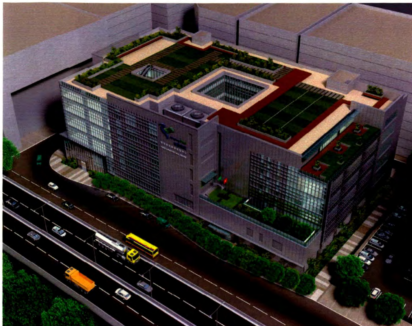
立體俯視圖 AXONOMETRIC OVERVIEW