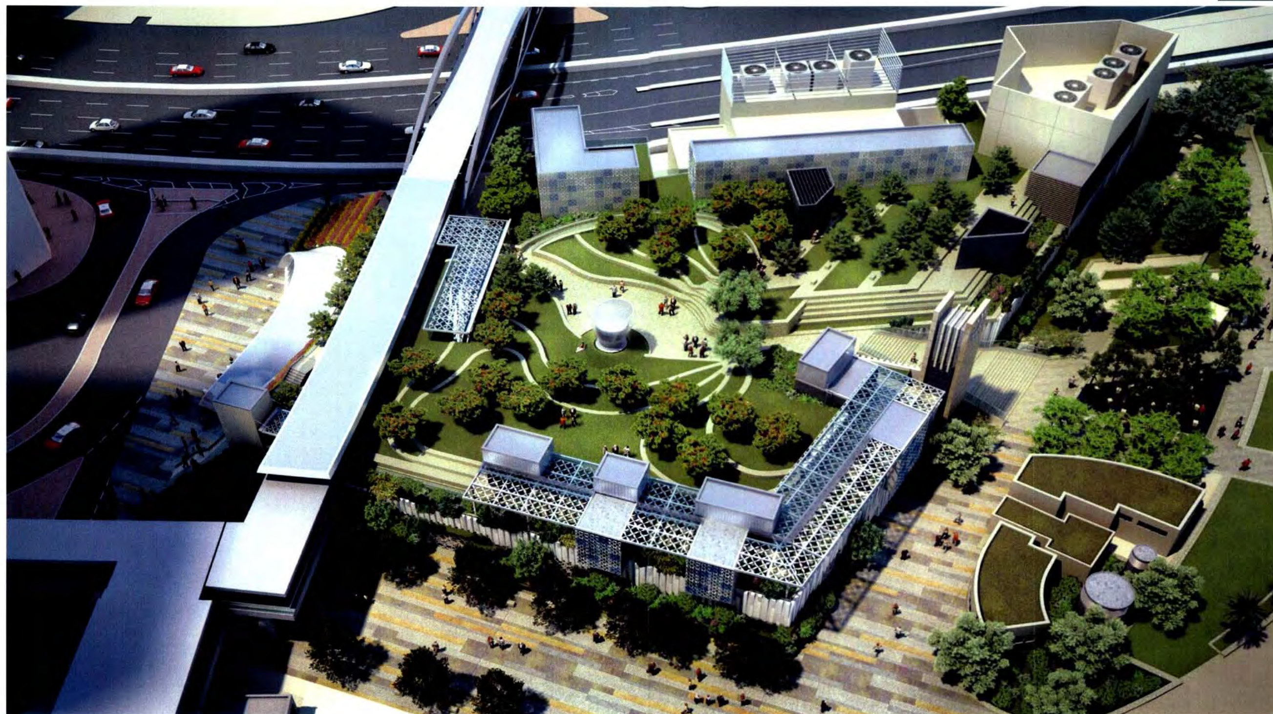
立體俯視圖 (夏慤花園) AXONOMETRIC OVERVIEW (HARCOURT GARDEN)