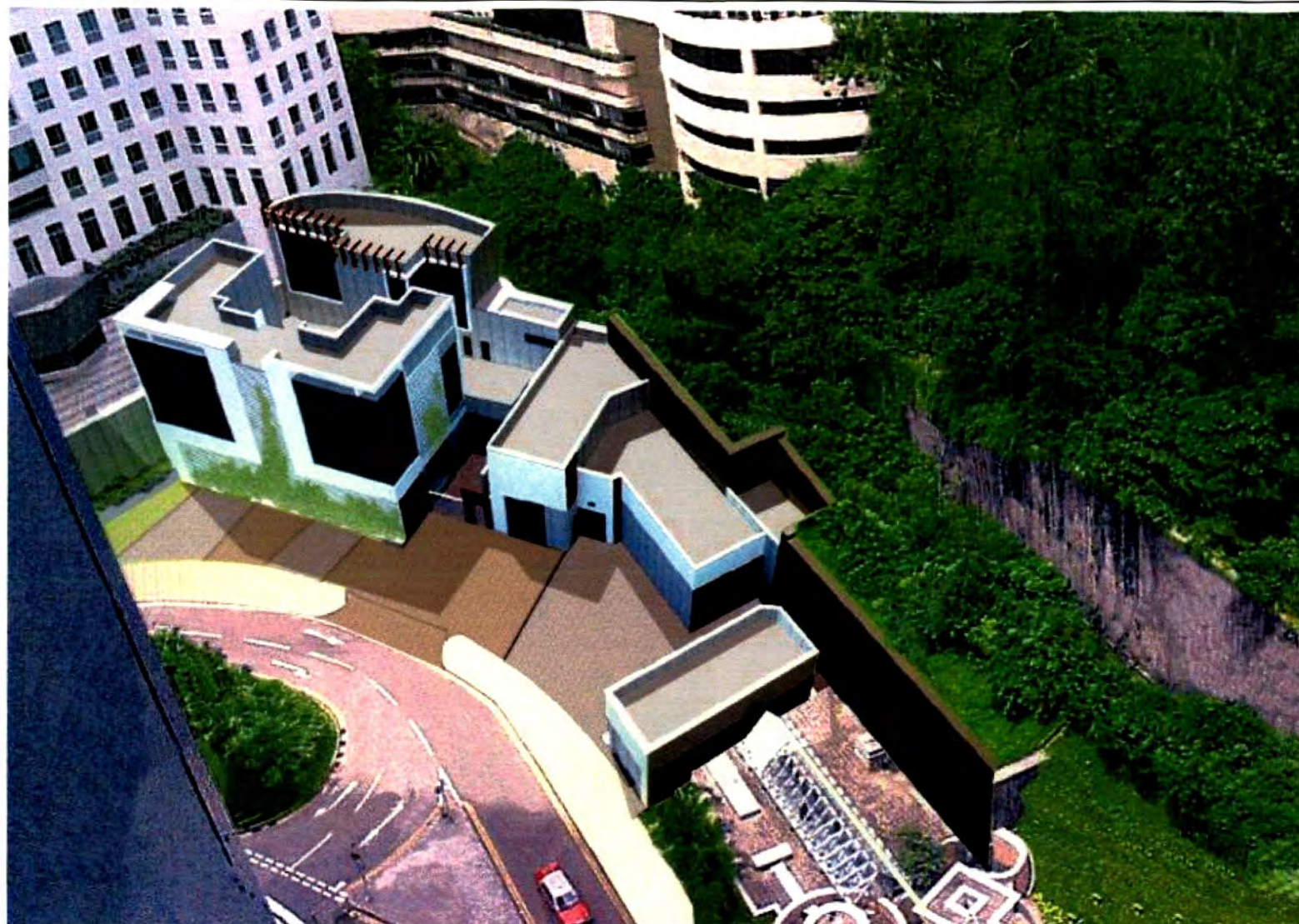
立體俯視圖 (香港公園) AXONOMETRIC OVERVIEW (HONG KONG PARK)