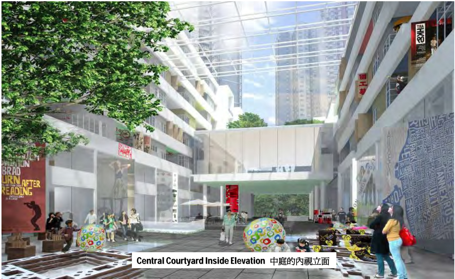
Central Courtyard Inside Elevation 中庭的內視立面