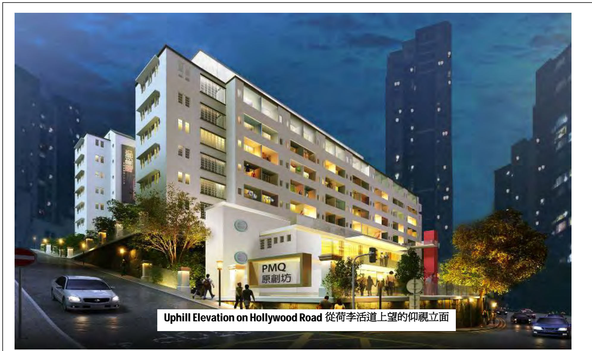
Uphill Elevation on Hollywood Road 從荷李活道上望的仰視立面