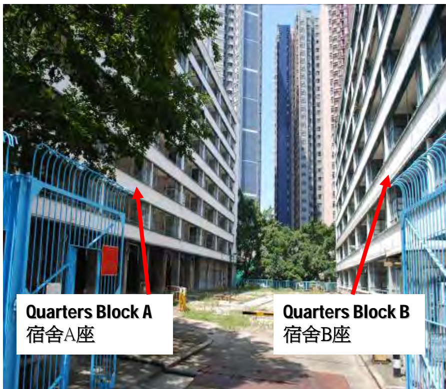
Quarters Block A 宿舍A座