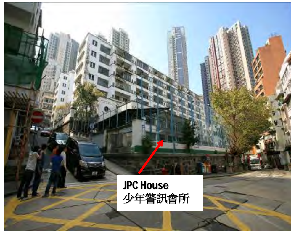
JPC House 少年警訊會所