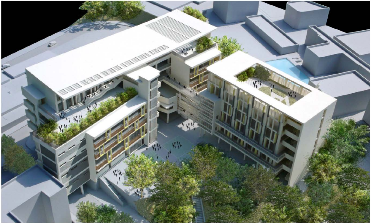
AERIAL VIEW OF THE NEW SCHOOL PREMISES FROM PERTH STREET SPORTS GROUND 從巴富街運動場望向校舍鳥瞰構思圖