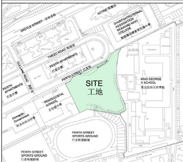
位置圖 LOCATION PLAN 1 : 3500