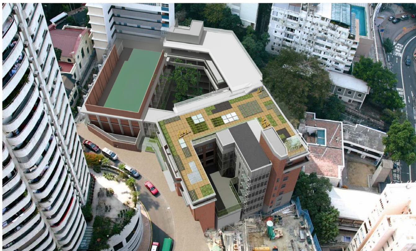
AERIAL VIEW OF THE SCHOOL PREMISES FROM CALDER PATH 從歌打老路望向校舍鳥瞰構思圖