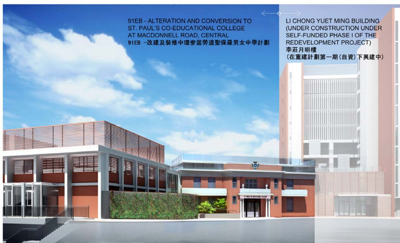
VIEW OF THE SCHOOL PREMISES FROM MACDONNELL ROAD 從麥當勞道望向校舍構思圖

91EB - ALTERATION AND CONVERSION TO ST. PAUL'S CO-EDUCATIONAL COLLEGE AT MACDONNELL ROAD, CENTRAL 91EB-改建及裝修中環麥當勞道聖保羅男女中學計劃