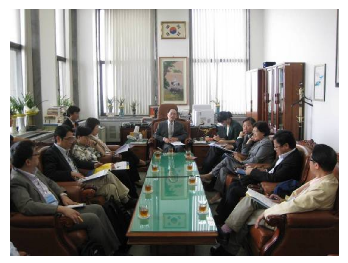
The delegation meets with the Environment and Labor Committee of the National Assembly.