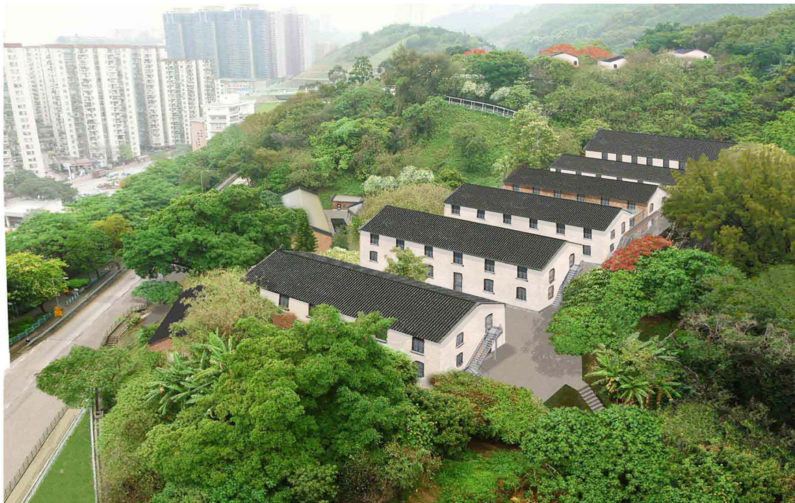
BIRD'S EYE VIEW OF THE ACADEMY AFTER REVITALISATION 活化後的文化館鳥瞰圖

2QW - REVITALISATION SCHEME – REVITALISATION OF THE FORMER LAI CHI KOK HOSPITAL INTO JAO TSUNG-I ACADEMY /THE HONG KONG CULTURAL HERITAGE