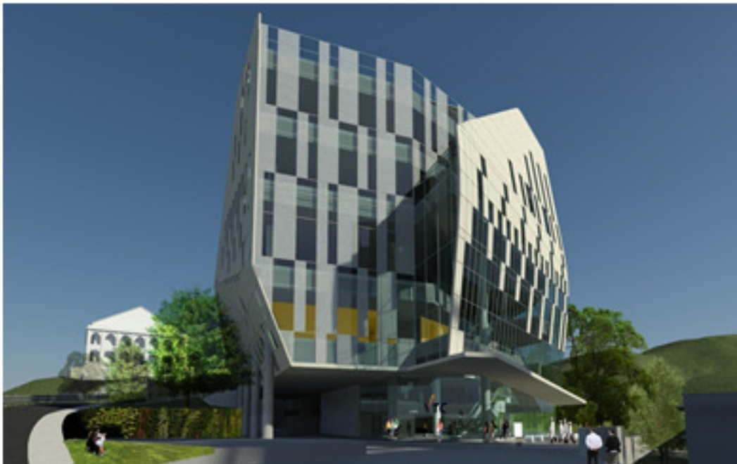
(View from VTC Pokfulam Complex – Main Entrance)