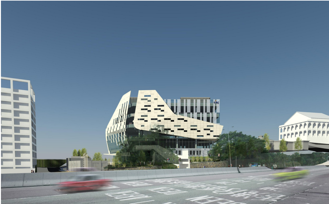
(View from Pok Fu Lam Road)