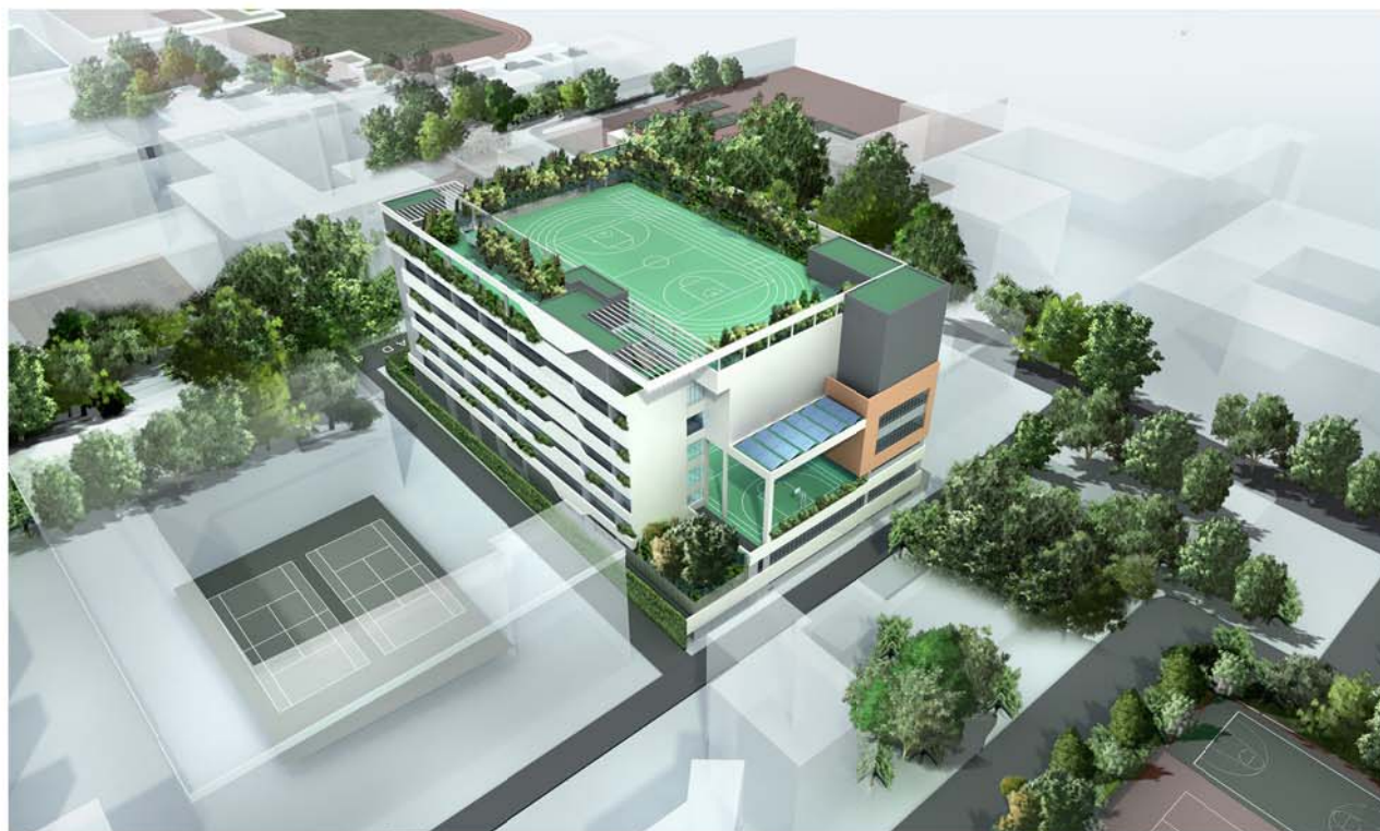
AERIAL VIEW OF THE NEW SCHOOL PREMISES FROM NORTHWEST 從西北面望向校舍鳥瞰構思圖

92EB - REDEVELOPMENT OF TUNG WAH GROUP OF HOSPITALS WONG FUT NAM COLLEGE AT OXFORD ROAD, KOWLOON