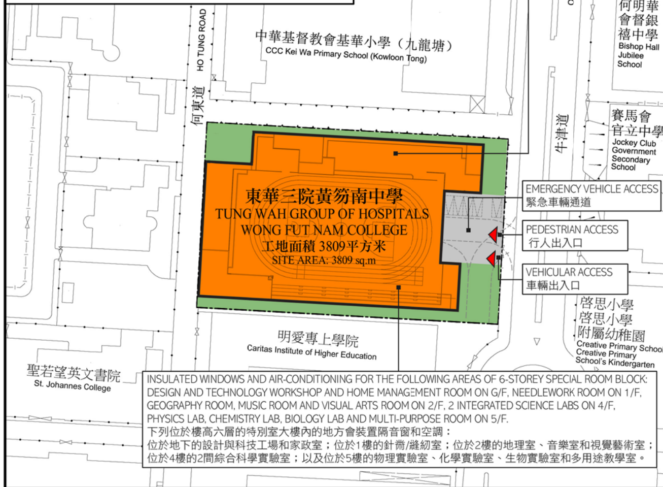
位置圖 LOCATION PLAN 1:3500

INSULATED WINDOWS AND AIR-CONDITIONING FOR THE FOLLOWING AREAS OF 6-STOREY SPECIAL ROOM BLOCK: DESIGN AND TECHNOLOGY WORKSHOP AND HOME MANAGEMENT ROOM ON G/F, NEEDLEWORK ROOM ON 1/F, GEOGRAPHY ROOM, MUSIC ROOM AND VISUAL ARTS ROOM ON 2/F, 2 INTEGRATED SCIENCE LABS ON 4/F, PHYSICS LAB, CHEMISTRY LAB, BIOLOGY LAB AND MULTI-PURPOSE ROOM ON 5/F. 下列位於樓高六層的特別室大樓內的地方會裝置隔音窗和空調： 位於地下的設計與科技工場和家政室；位於1樓的針織/縫紉室；位於2樓的地理室、音樂室和視覺藝術室； 位於4樓的2間綜合科學實驗室；以及位於5樓的物理實驗室、化學實驗室、生物實驗室和多用途教學室。