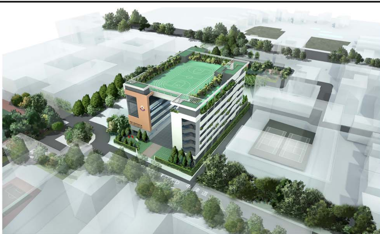
AERIAL VIEW OF THE NEW SCHOOL PREMISES FROM NORTHEAST 從東北面望向校舍鳥瞰構思圖