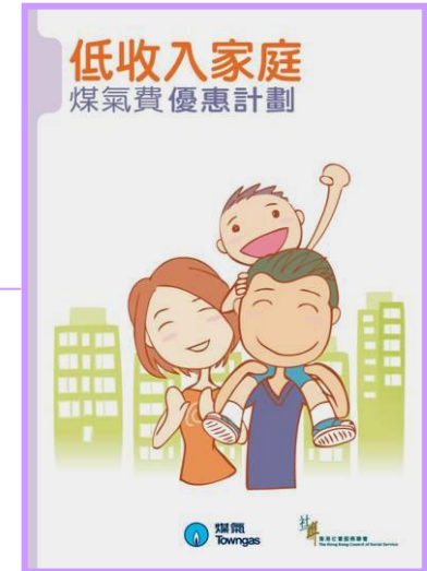
(Low income families)