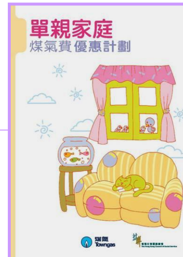
(Single parent families)