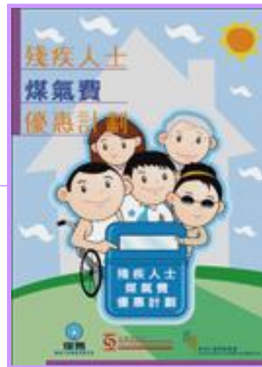
(People with disabilities)