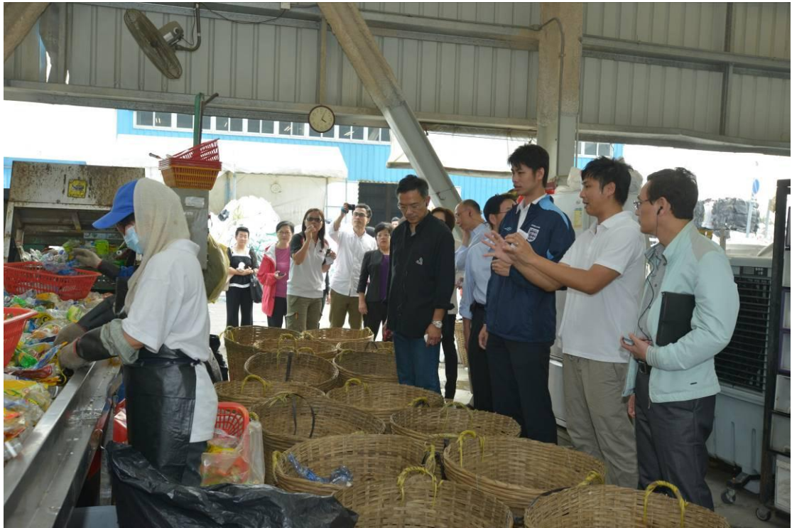
LegCo Members visit the plant engaging in recycling waste plastic in Eco Park and receive a briefing on its operation.