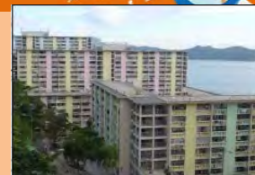
華富邨 Wah Fu Estate