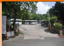
華樂徑 Wah Lok Path