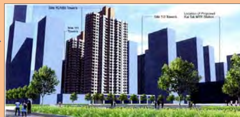
住用地積比率為6倍 Domestic PR of 6