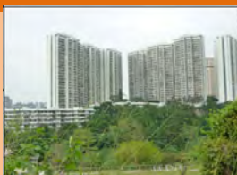
近置富路 Near Chi Fu Road