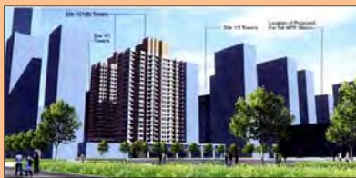
住用地積比率為5倍 Domestic PR of 5