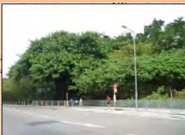
華富北及華景街 Wah Fu North and Wah King Street