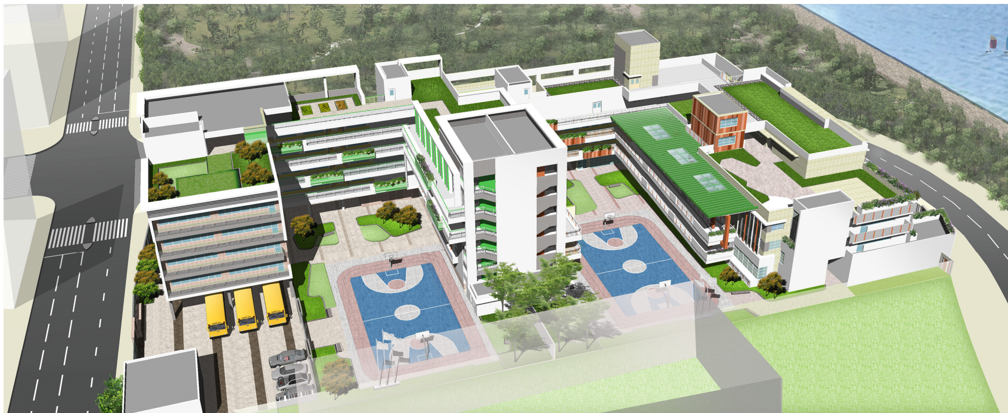
中度智障兒童學校 MoID SCHOOL