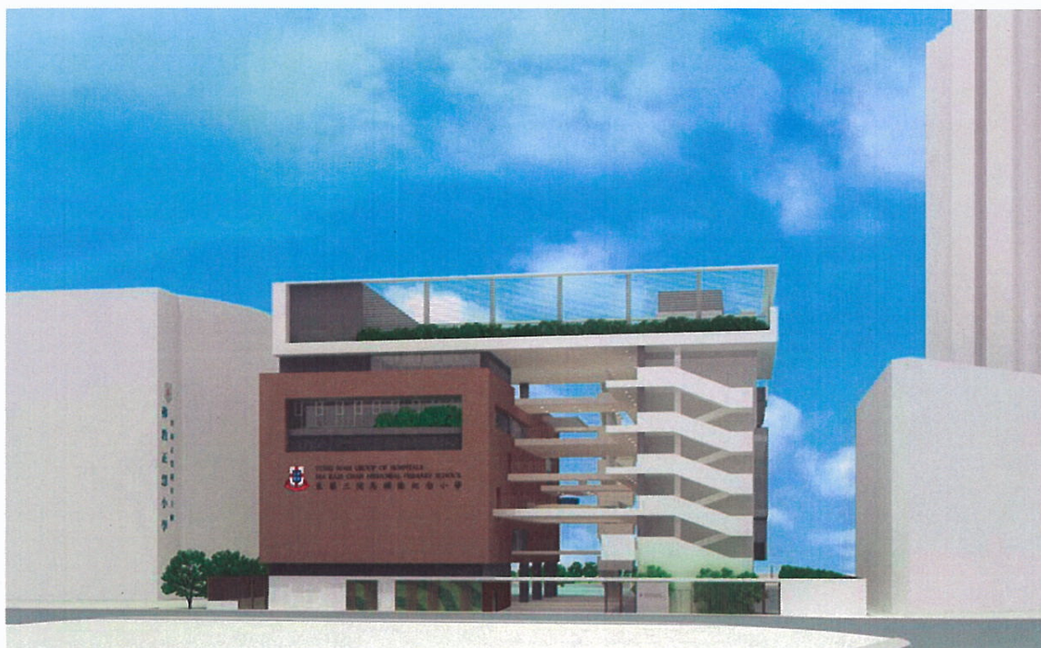
PERSPECTIVE VIEW FROM EASTERN ENTRANCE AT CHING SHING ROAD (ARTIST'S IMPRESSION) 從東面清城路望向小學的構思透視圖