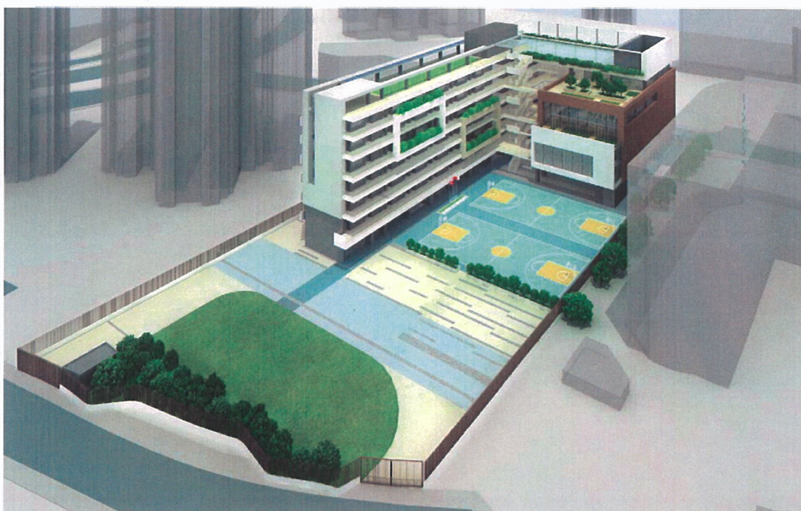
AERIAL VIEW FROM SOUTH WESTERN DIRECTION (ARTIST'S IMPRESSION) 從西南面望向小學的鳥瞰構思圖