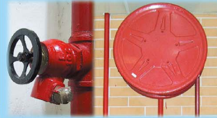
消防栓 / 喉轆系統 Hydrant / Hose Reel System