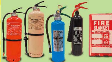
手提滅火裝備 Portable Firefighting Equipment

食物環境衛生署會在收到消防處的通知後就違反 消防安全規定的持牌條件發出警告信。 FEHD will issue warning letter for breach of licensing condition due to non-compliance of FSRs upon notification by FSD. 違反多於一項主要消防安全規定可引致食物業牌照 被暫時吊銷。 Non-compliance of more than one Major FSRs is liable to suspension of food business licence.