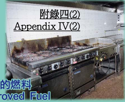
附錄四(2) Appendix IV(2)