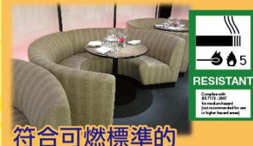
符合可燃標準的 聚氨酯乳膠 PU Foam conformed to Flammability Standard