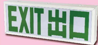
出口指示牌 Exit Sign