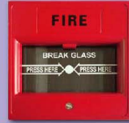
手動火警警報系統 Manual Fire Alarm System