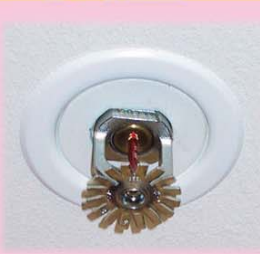
花灑系統 Sprinkler System