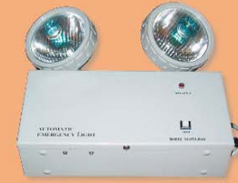
應急照明系統 Emergency Lighting