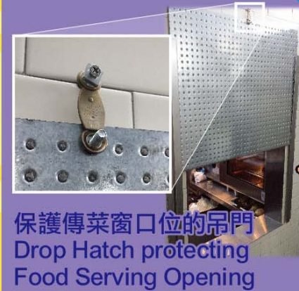
保護傳菜窗口位的吊門 Drop Hatch protecting Food Serving Opening

食物環境衛生署會在收到消防處的通知後就違反 消防安全規定的持牌條件發出警告信。 FEHD will issue warning letter for breach of licensing condition due to non-compliance of FSRs upon notification by FSD. 違反多於一項主要消防安全規定可引致食物業牌照 被暫時吊銷。 Non-compliance of more than one Major FSRs is liable to suspension of food business licence.