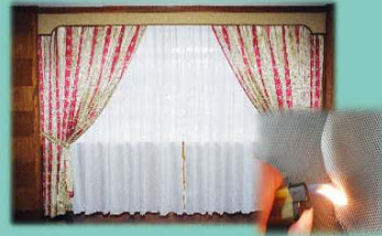
防火漆 / 溶液處理 Fire Retardant Paint / Solution Treatment