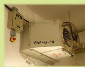
排煙系統 Smoke Extraction System