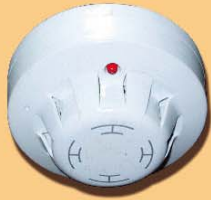
火警偵測系統 Fire Detection System

持牌人須時刻遵從 消防安全規定。 The licensee must continue to comply with FSRs.