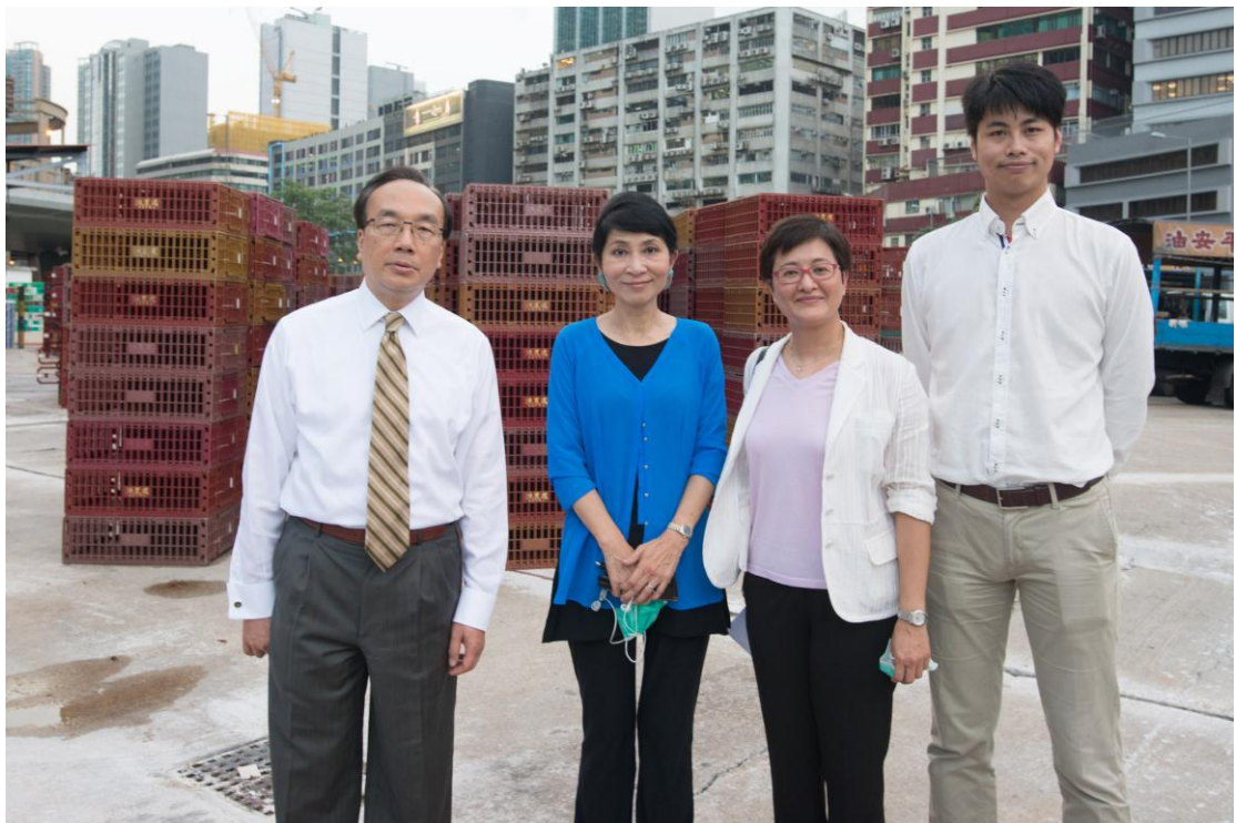
Legislative Council Members visit the facilities in CSW Temporary Wholesale Poultry Market.