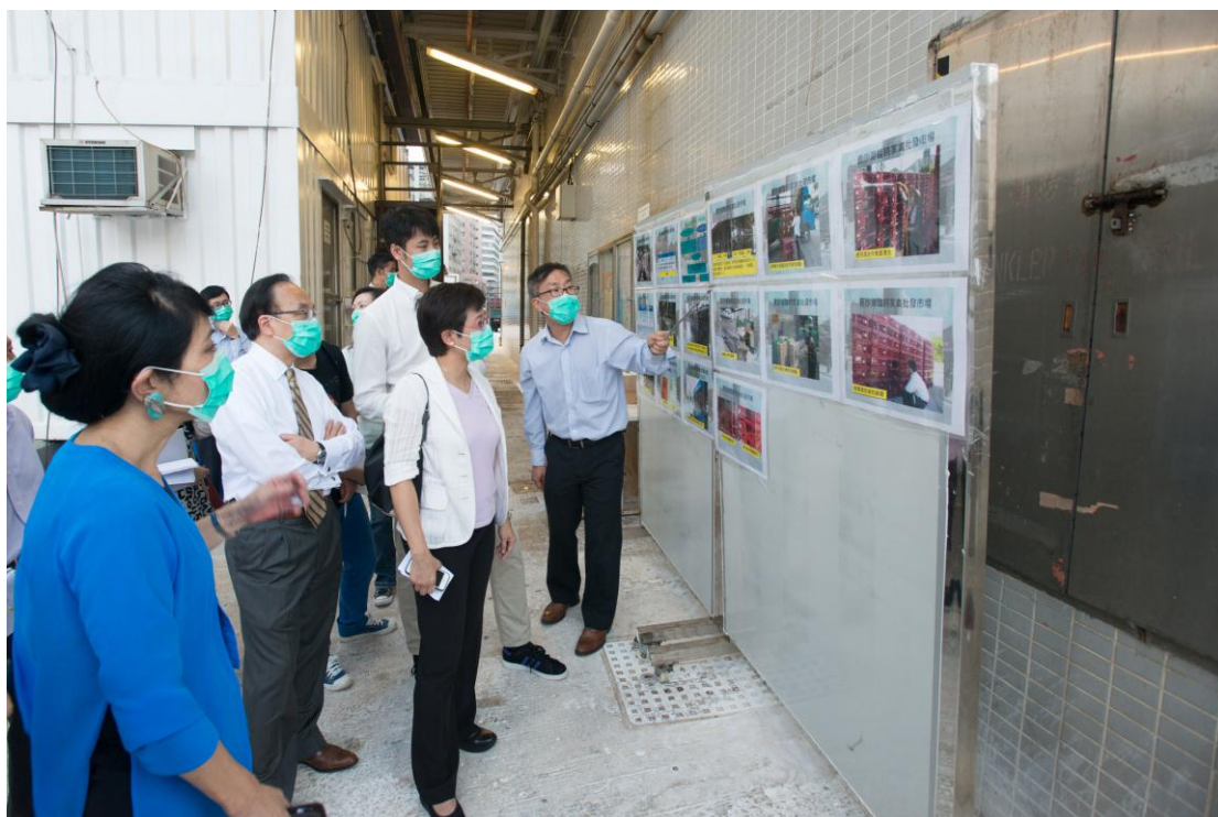
Legislative Council Members receive a briefing on the operation of CSW Temporary Wholesale Poultry Market by officers of the Agriculture, Fisheries and Conservation Department.