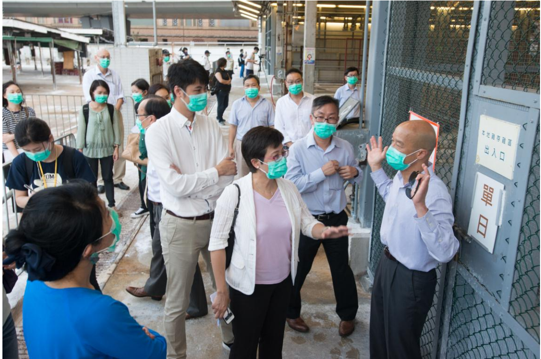
Legislative Council Members observe segregation measures in CSW Temporary Wholesale Poultry Market.