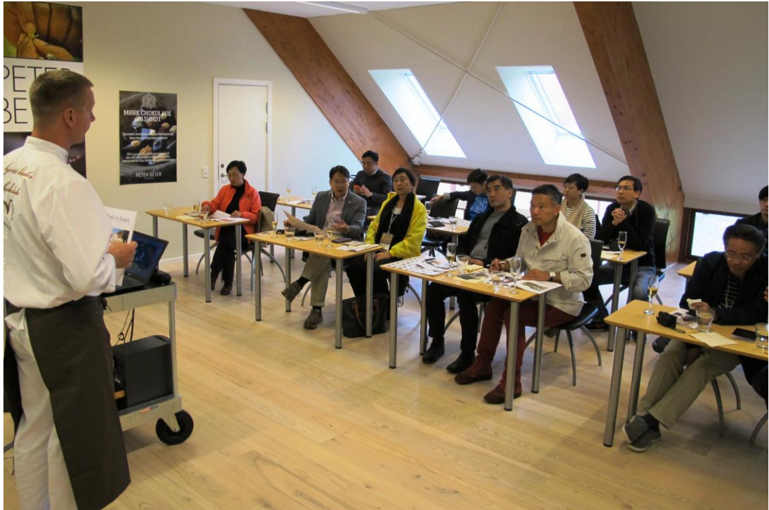
The LegCo delegation visits a chocolate manufacturer in Copenhagen and receives a presentation on the latest development of food processing industry in Denmark.